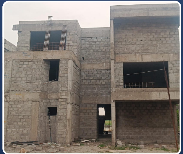
VILLA-185 (Structure Completed)