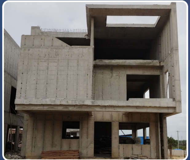
VILLA-30 (Structure Completed)