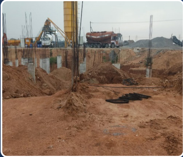
VILLA-164 (Pedestals Completed)