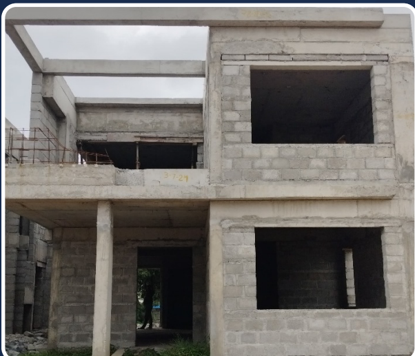
VILLA-5 (Structure Completed)