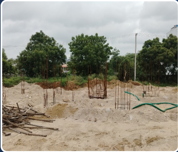
VILLA-1 (Pedestals Completed)