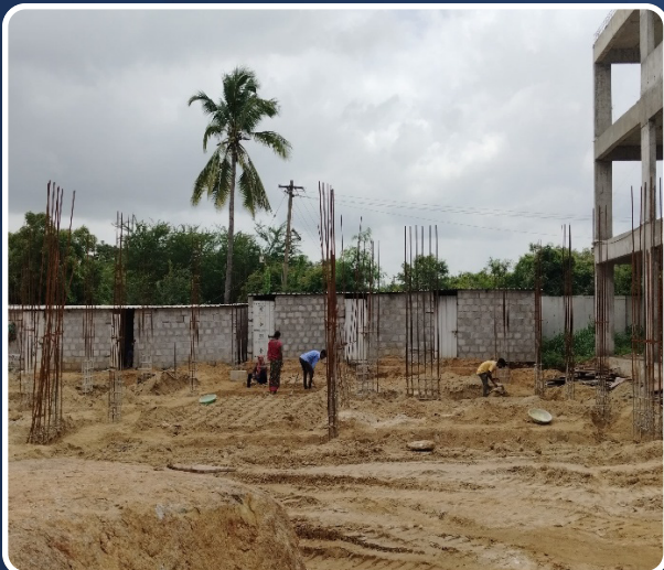
VILLA-56 (Backfilling Completed)