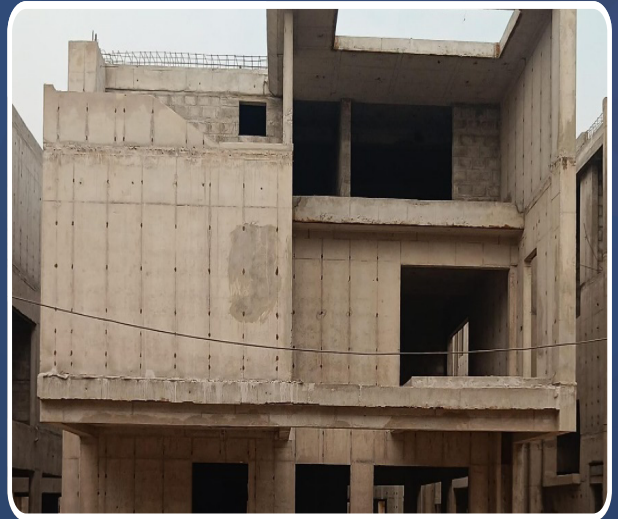
VILLA-129 (Structure Completed)