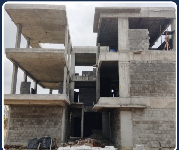
VILLA-22 (Structure Completed)