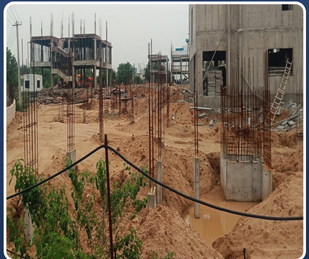
VILLA-32 (Pedestals Completed)