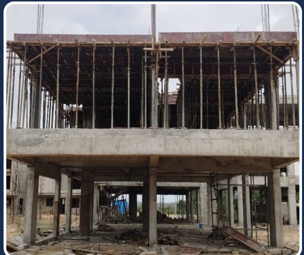
VILLA-15 (FF Columns Completed)