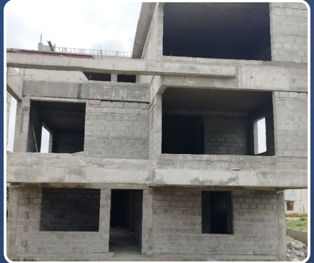
VILLA-8 (Structure Completed)