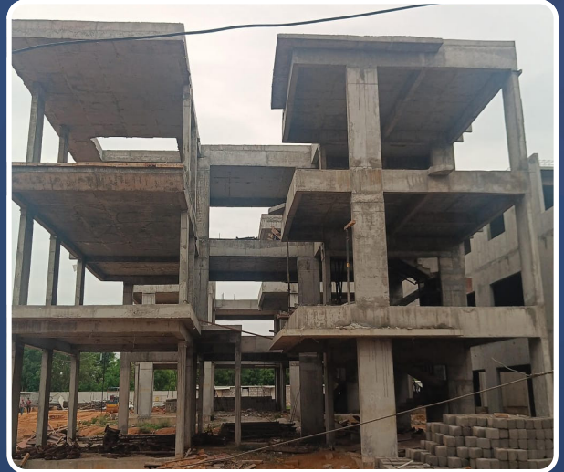
VILLA-87 (Structure Completed)