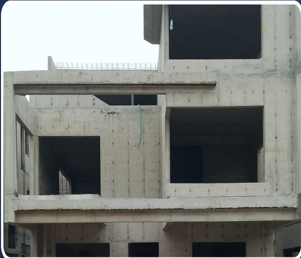
VILLA-118 (Structure Completed)