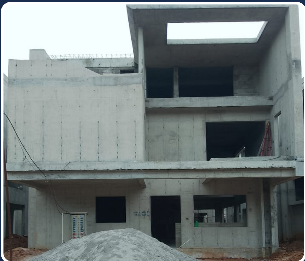
VILLA-71 (Structure Completed)