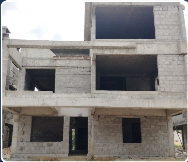
VILLA-23 (Structure Completed)