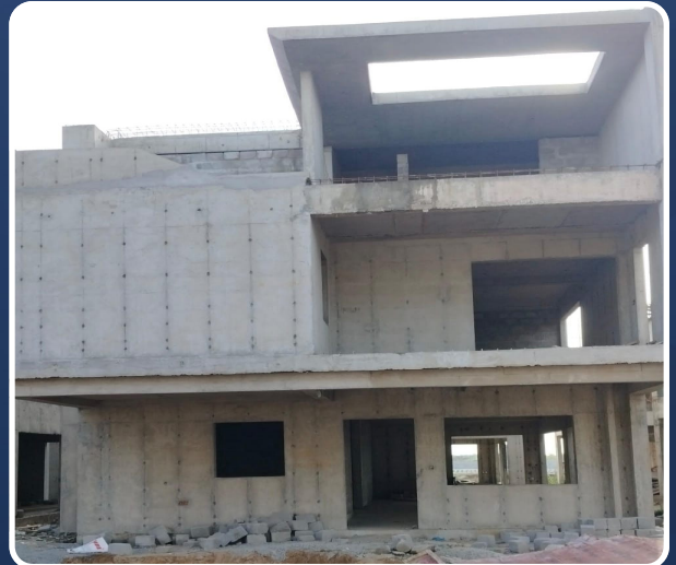
VILLA-137 (Structure Completed)