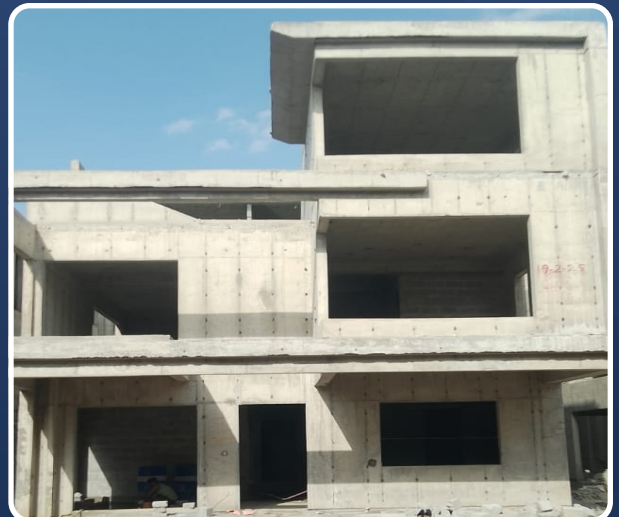
VILLA-149 (Structure Completed)