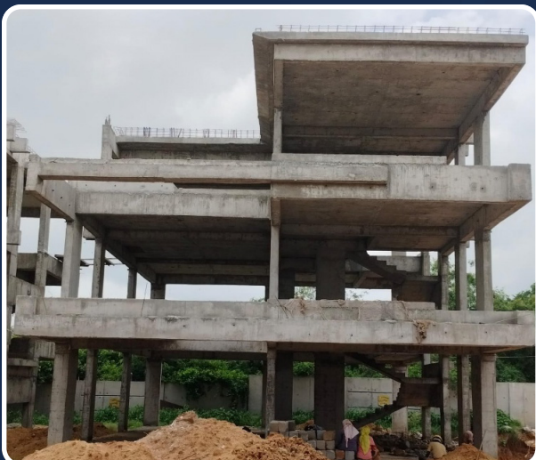
VILLA-58 (Structure Completed)