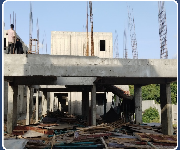
VILLA-153 (GF Slab Completed)