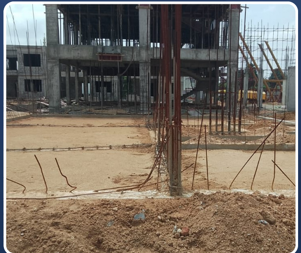
VILLA-20 (Plinth Beam Completed)