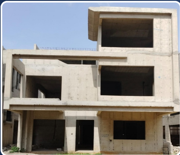
VILLA-82 (Structure Completed)