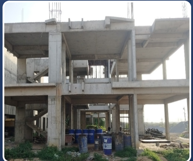
VILLA-161 (FF Slab Completed)