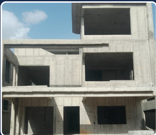
VILLA-174 (Structure Completed)