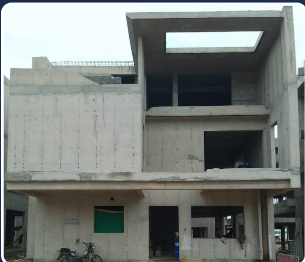
VILLA-65 (Structure Completed)