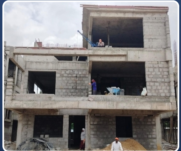
VILLA-50 (Structure Completed)