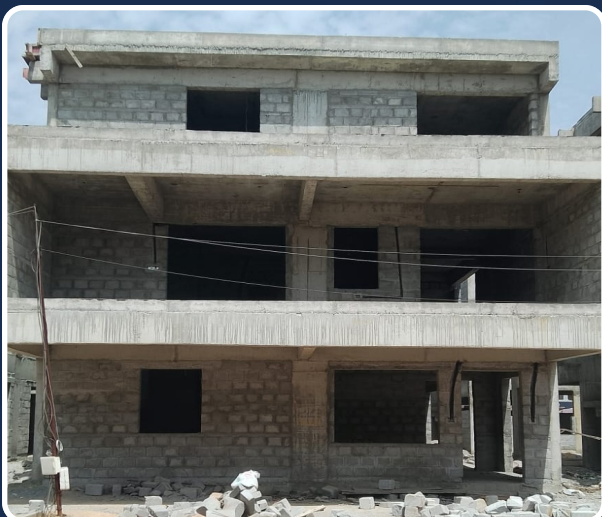
VILLA-39 (Structure Completed)