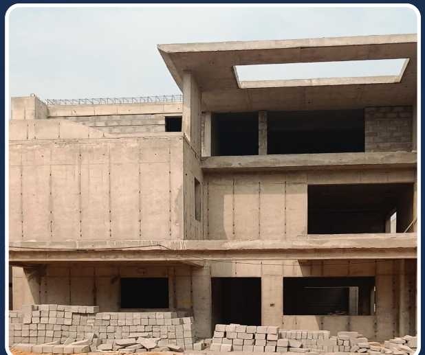
VILLA-157 (FF Slab Completed)