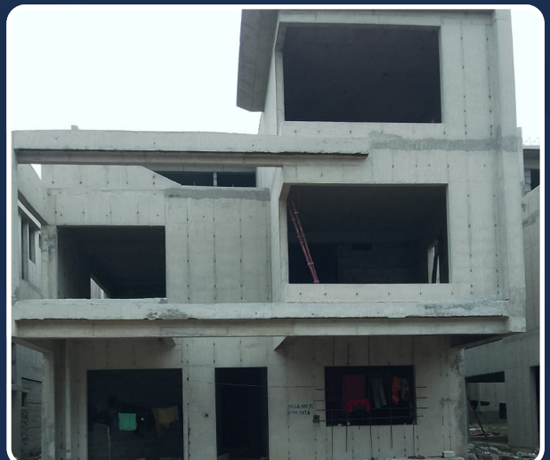
VILLA-91 (Structure Completed)