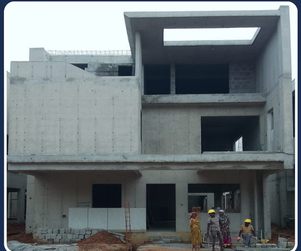
VILLA-72 (Structure Completed)