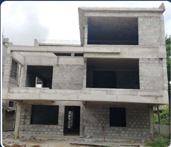
VILLA-37 (Structure Completed)