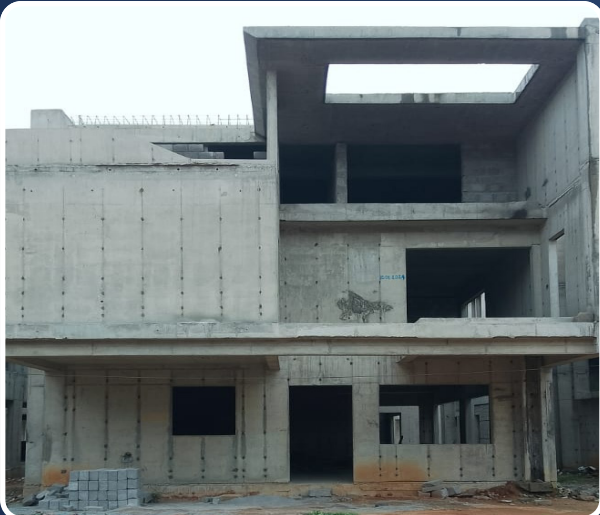
VILLA-106 (Structure Completed)