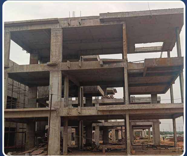
VILLA-101 (Structure Completed)