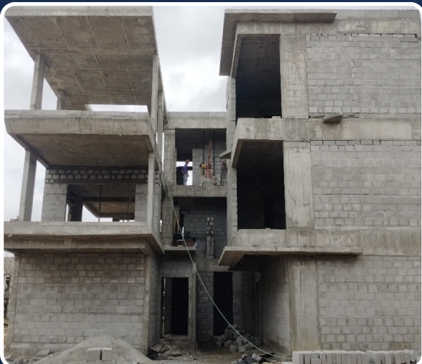
VILLA-45 (Structure Completed)