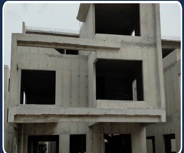
VILLA-121 (Structure Completed)