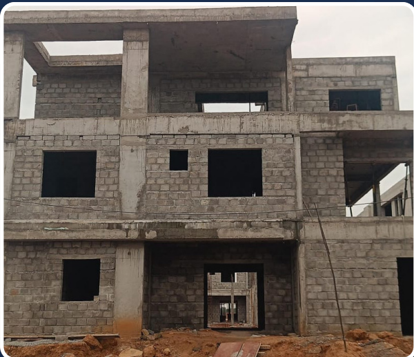
VILLA-102 (Structure Completed)