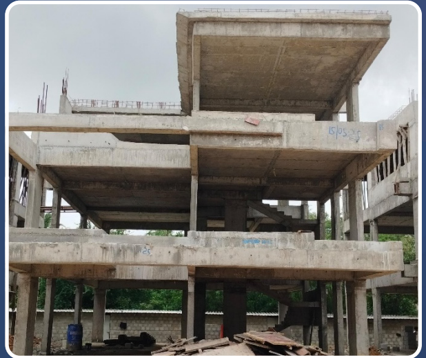
VILLA-189 (SF Slab Completed)