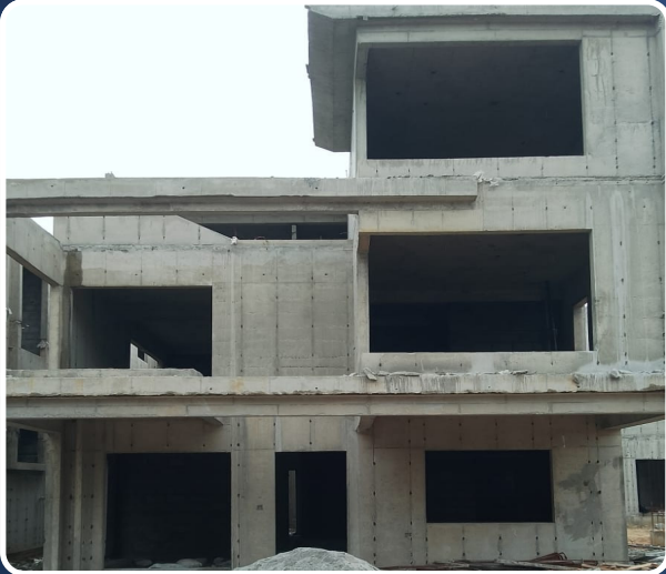
VILLA-152 (Structure Completed)