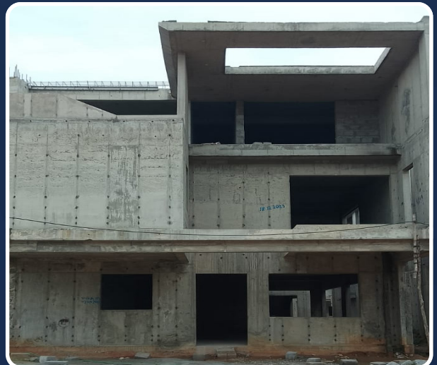
VILLA-103 (Structure Completed)