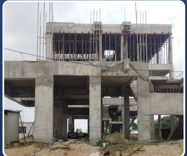
VILLA-44 (GF Slab Completed)