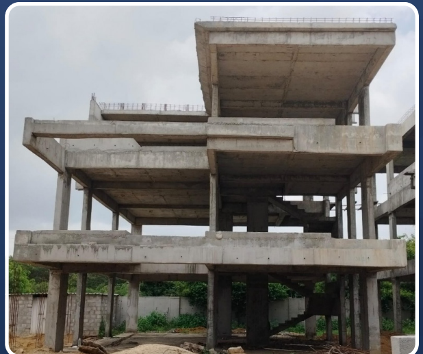
VILLA-57 (Structure Completed)