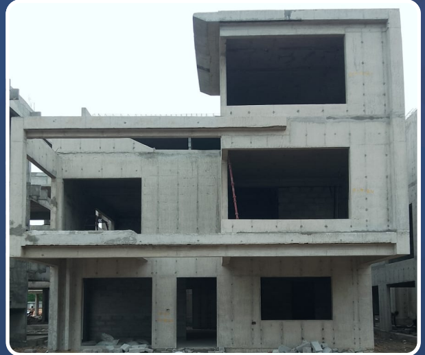
VILLA-117 (Structure Completed)