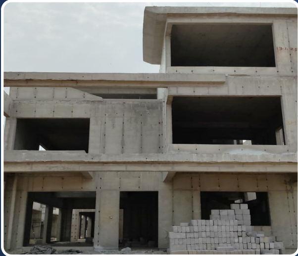
VILLA-140 (Structure Completed)