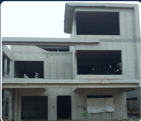
VILLA-90 (Footings Completed)