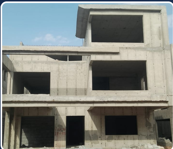
VILLA-150 (Structure Completed)