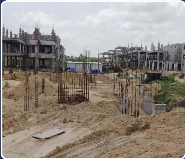
VILLA-170 (Footings Completed)