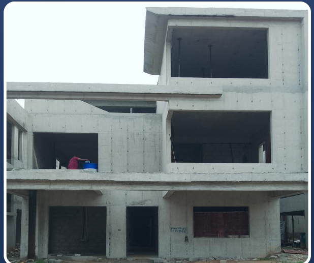
VILLA-89 (Structure Completed)