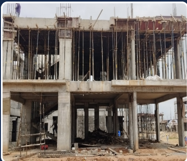
VILLA-27 (FF Slab Completed)