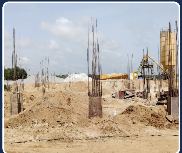
VILLA-163 (Pedestals Completed)