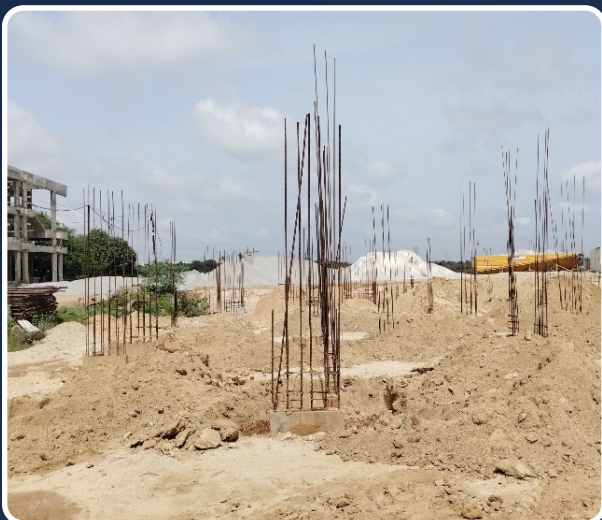
VILLA-162 (Pedestals Completed)