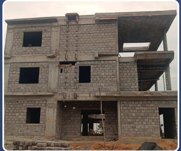
VILLA-42 (Structure Completed)