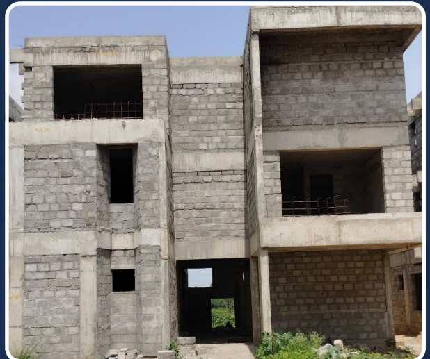
VILLA-181 (Structure Completed)