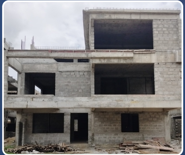
VILLA-36 (Structure Completed)