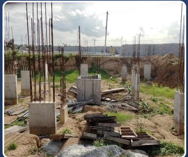
VILLA-167 (Pedestals Completed)