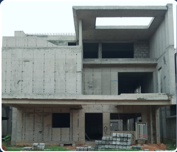
VILLA-104 (Structure Completed)