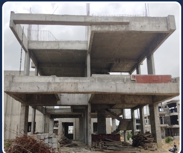
VILLA-34 (FF Slab Completed)