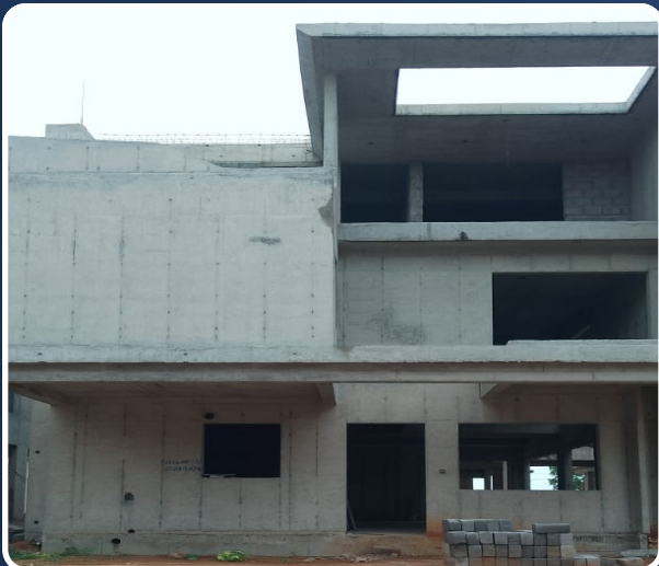
VILLA-75 (Structure Completed)