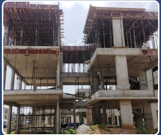
VILLA-171 (SF Columns Completed)