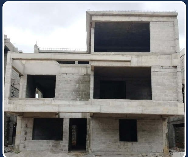
VILLA-46 (Structure Completed)