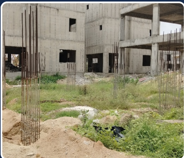
VILLA-33 (Pedestals Completed)