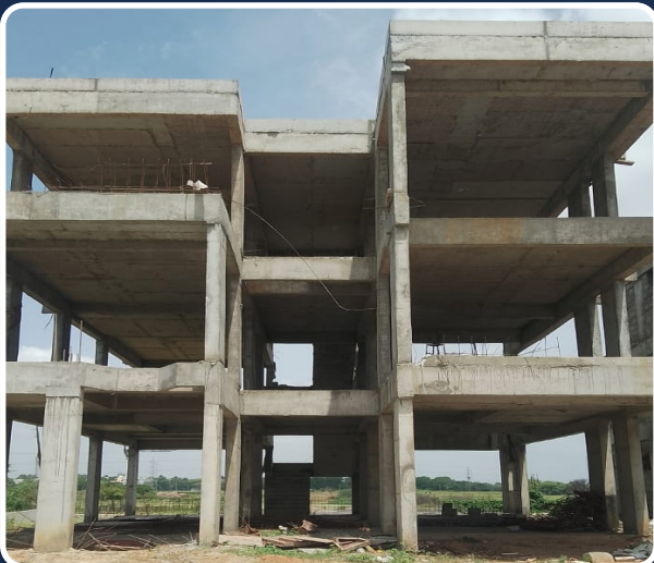
VILLA-180 (Structure Completed)