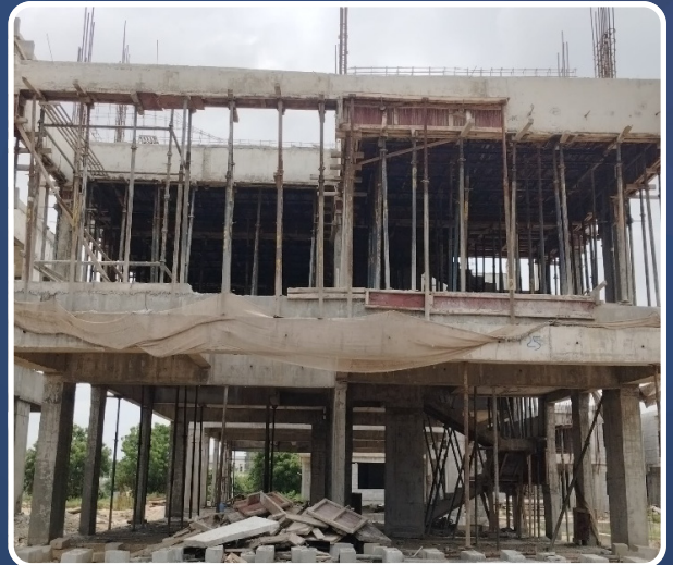
VILLA-18 (FF Slab Completed)