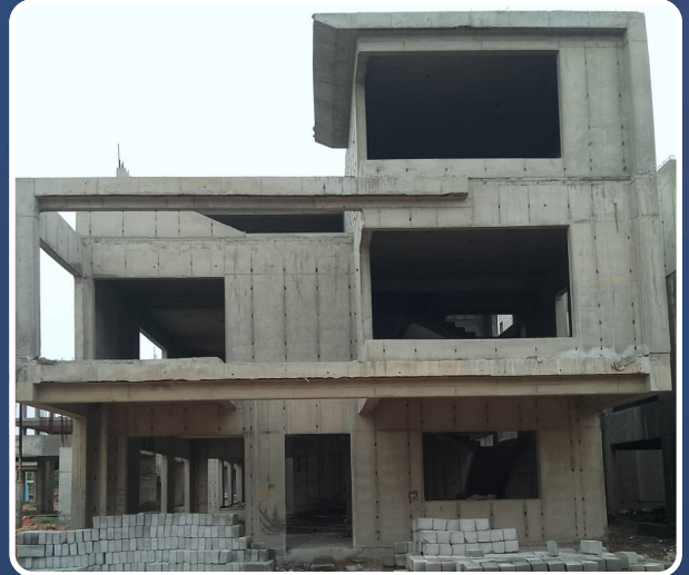
VILLA-147 (Structure Completed)