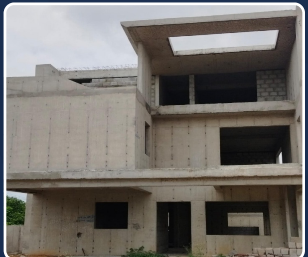
VILLA-60 (Structure Completed)