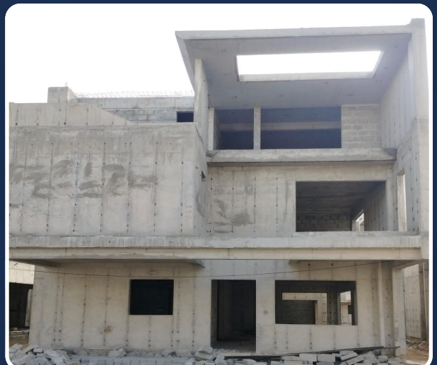
VILLA-127 (Structure Completed)