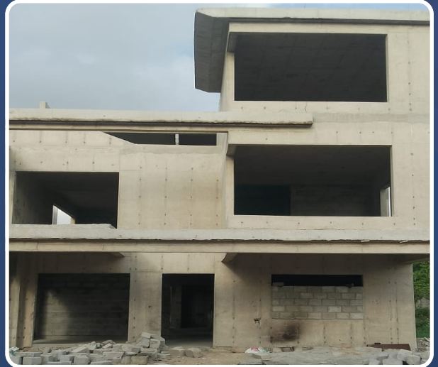
VILLA-93 (Structure Completed)