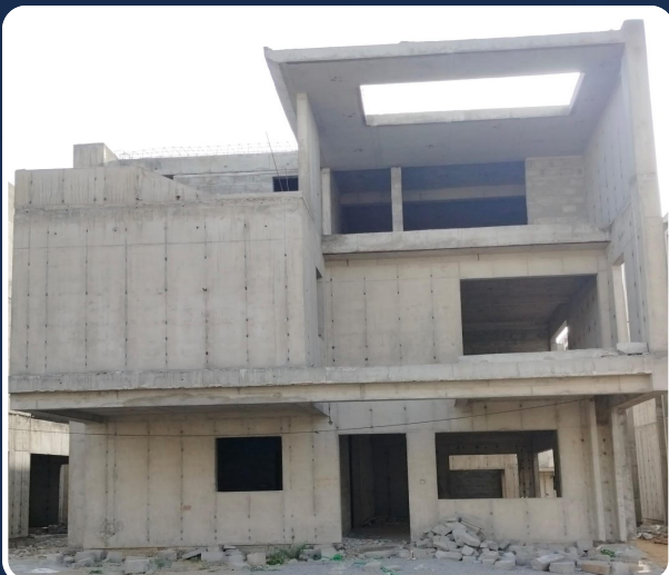
VILLA-126 (Structure Completed)