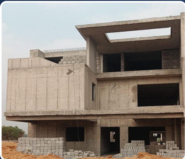
VILLA-154 (Structure Completed)