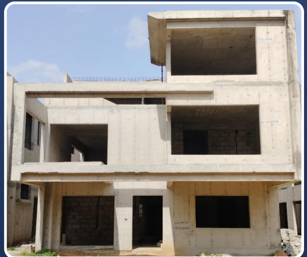
VILLA-83 (Structure Completed)