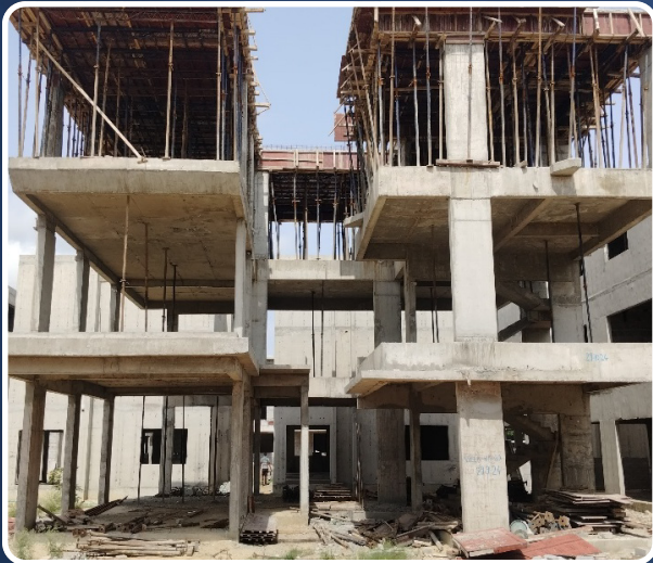
VILLA-80 (SF Columns Completed)