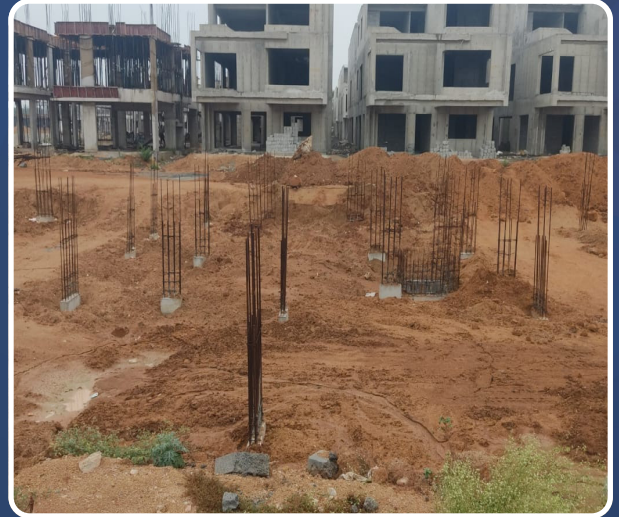
VILLA-165 (Pedestals Completed)