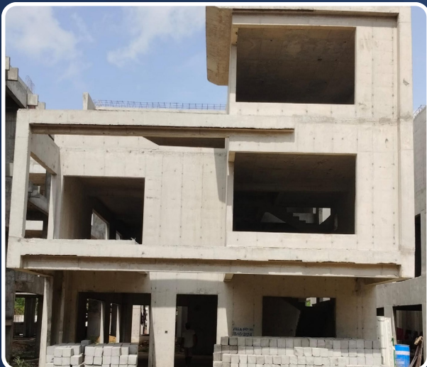
VILLA-88 (Structure Completed)