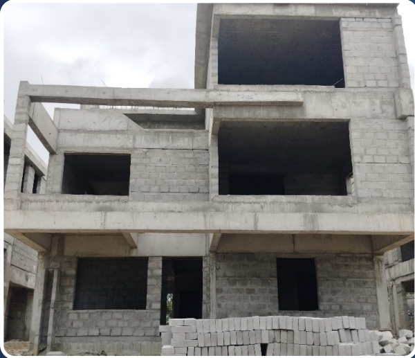
VILLA-7 (Structure Completed)