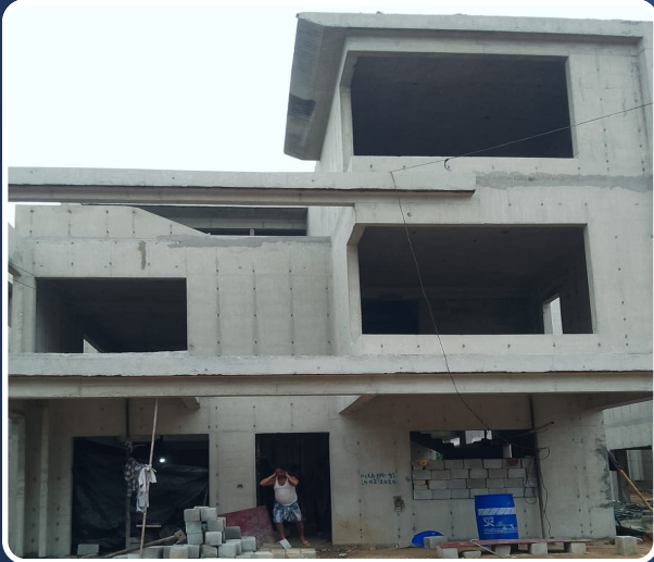
VILLA-92 (Structure Completed)