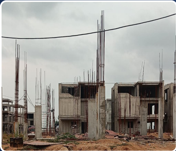
VILLA-12 (Ground Floor Columns Completed)