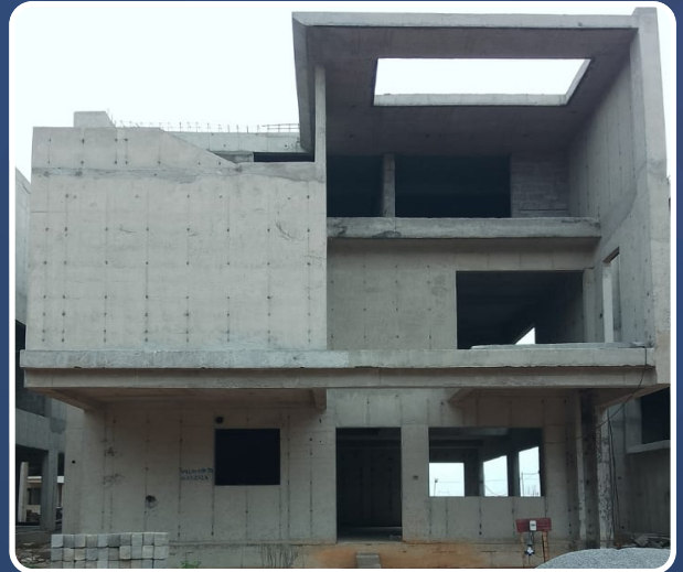
VILLA-74 (Structure Completed)