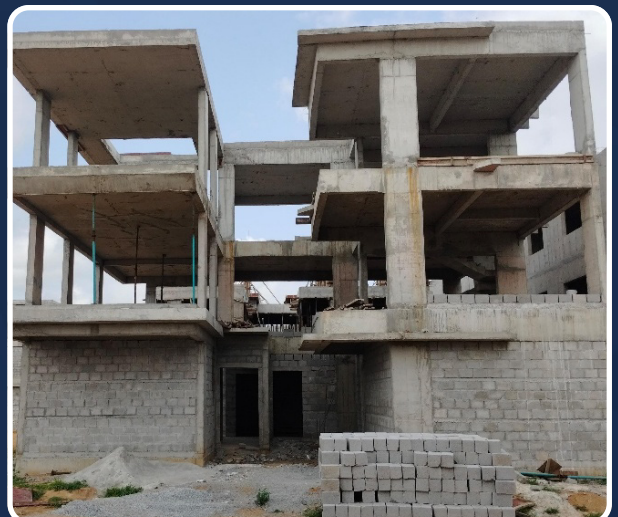
VILLA-109 (Structure Completed)