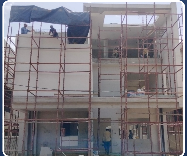
VILLA-70 (Structure Completed)