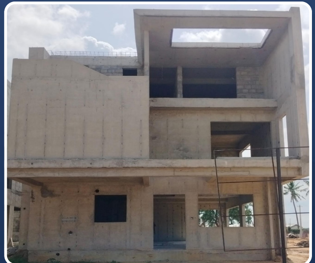
VILLA-76 (Structure Completed)