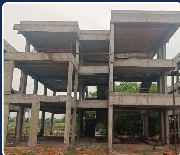
VILLA-186 (Structure Completed)