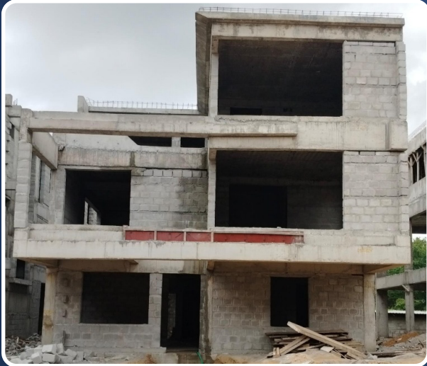
VILLA-47 (Structure Completed)