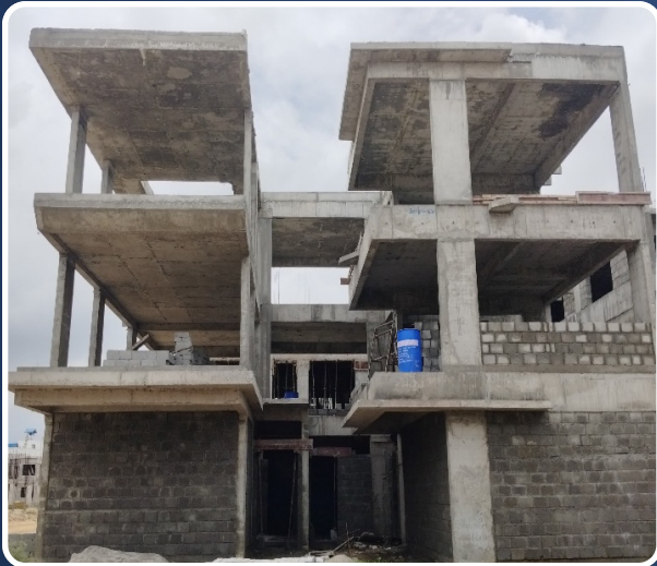
VILLA-35 (Structure Completed)