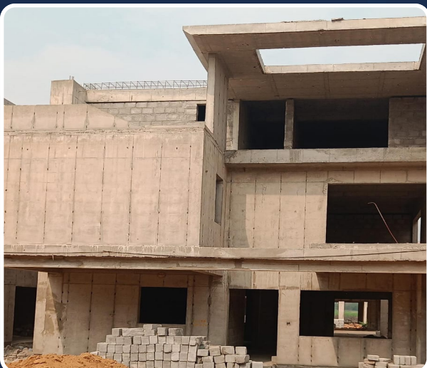
VILLA-156 (Structure Completed)