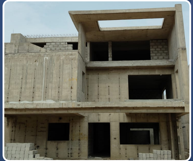
VILLA-135 (Structure Completed)