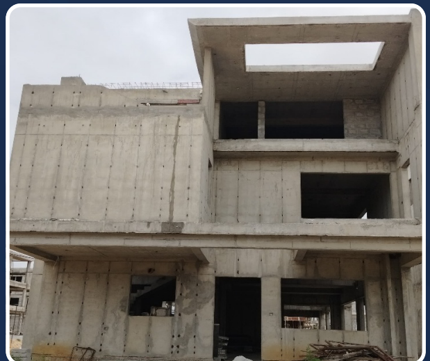
VILLA-28 (Structure Completed)