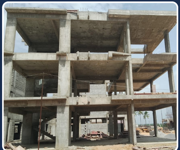
VILLA-40 (Structure Completed)