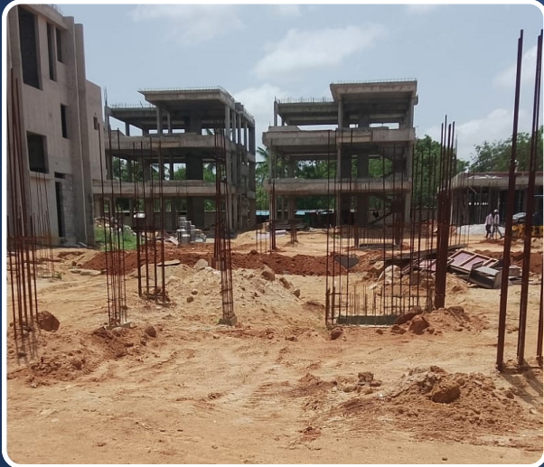
VILLA-86 (Back Filling Completed)