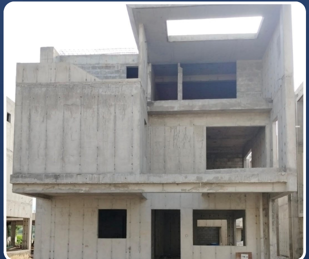
VILLA-125 (Structure Completed)