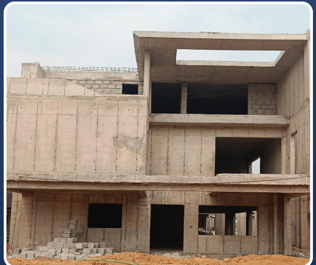
VILLA-155 (Structure Completed)