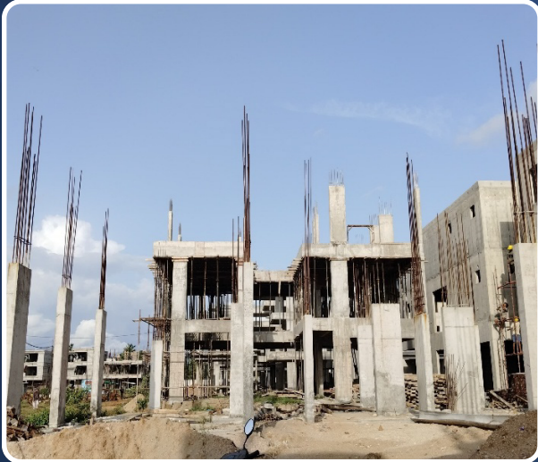
VILLA-146 (FF Slab Completed)