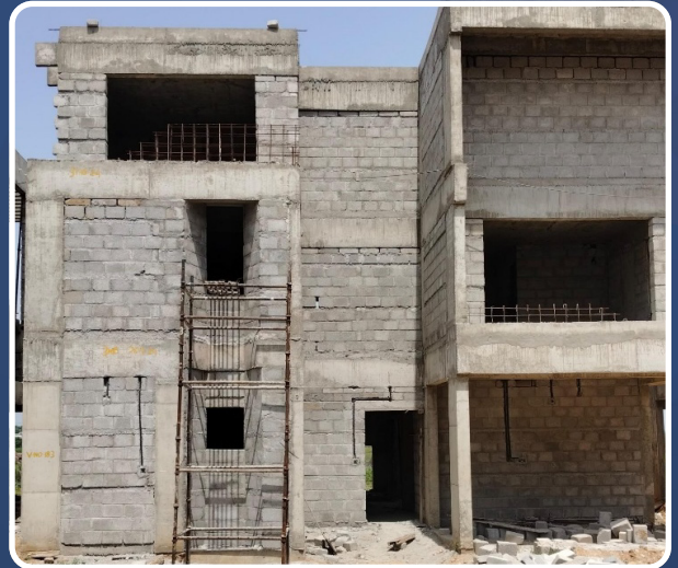
VILLA-183 (Structure Completed)