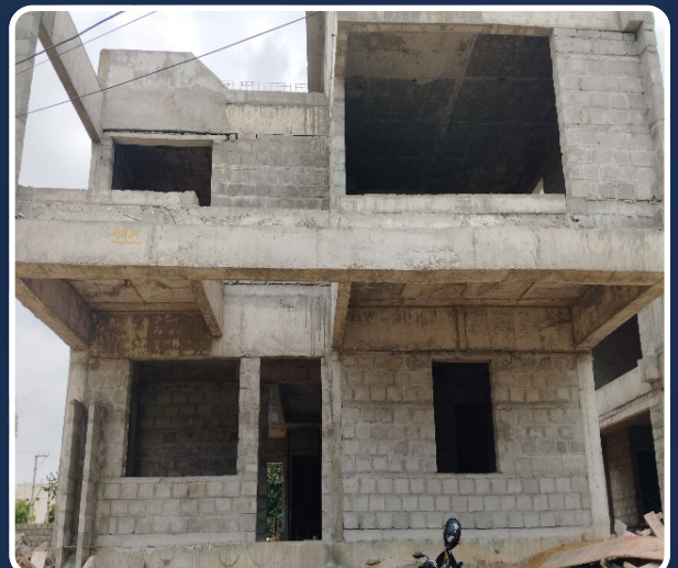
VILLA-6 (Structure Completed)