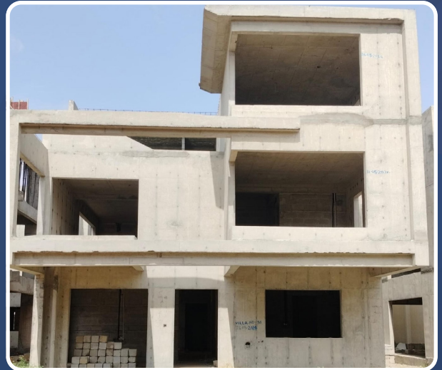
VILLA-81 (Structure Completed)