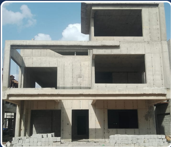
VILLA-172 (Structure Completed)