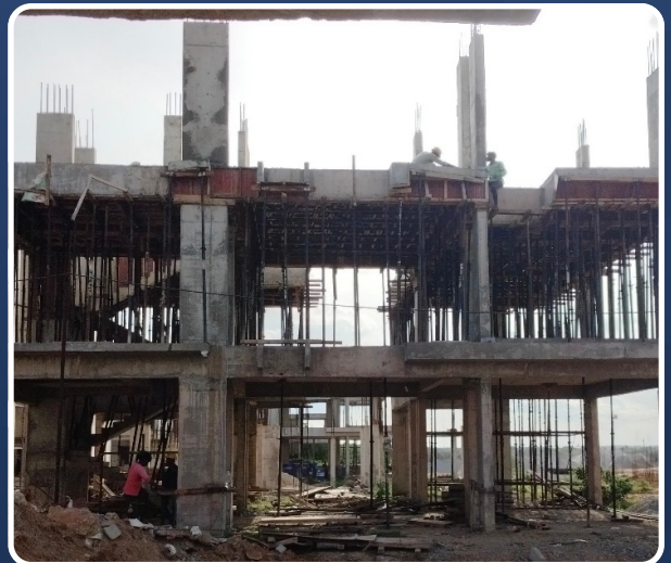
VILLA-131 (SF slab Completed)