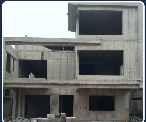
VILLA-151 (Structure Completed)