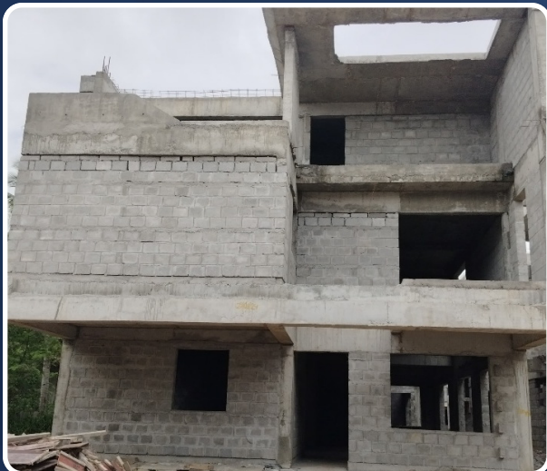
VILLA-25 (Structure Completed)