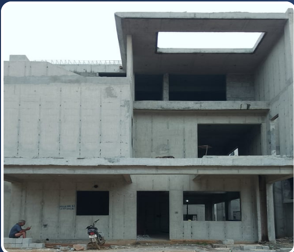
VILLA-63 (Structure Completed)