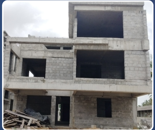
VILLA-24 (Structure Completed)