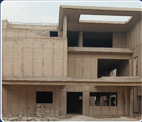
VILLA-128 (Structure Completed)