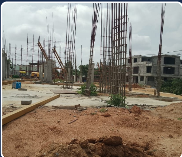
VILLA-21 (Grade Slab Completed)