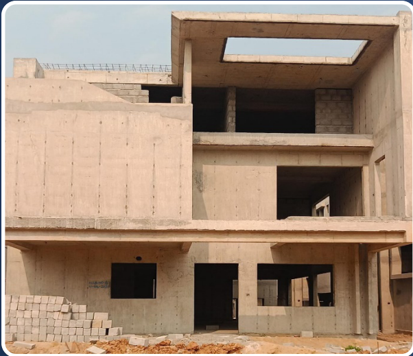
VILLA-61 (Structure Completed)