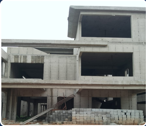
VILLA-176 (Structure Completed)