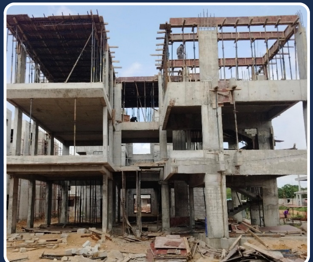
VILLA-115 (SF Columns Completed)