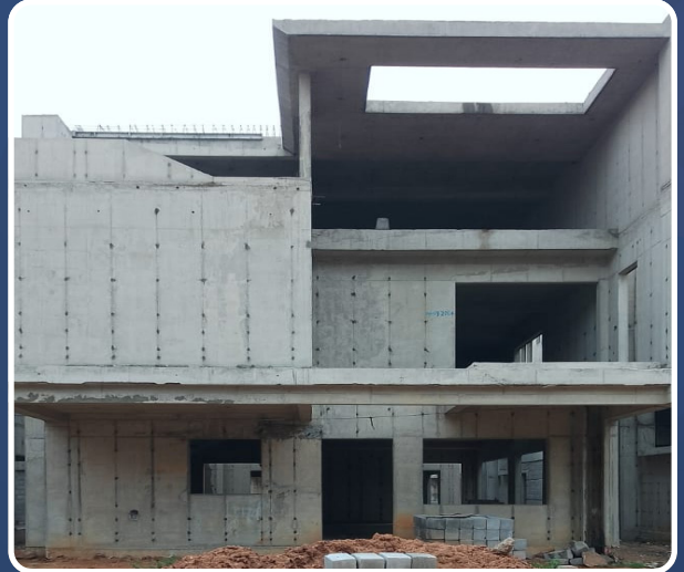
VILLA-105 (Structure Completed)