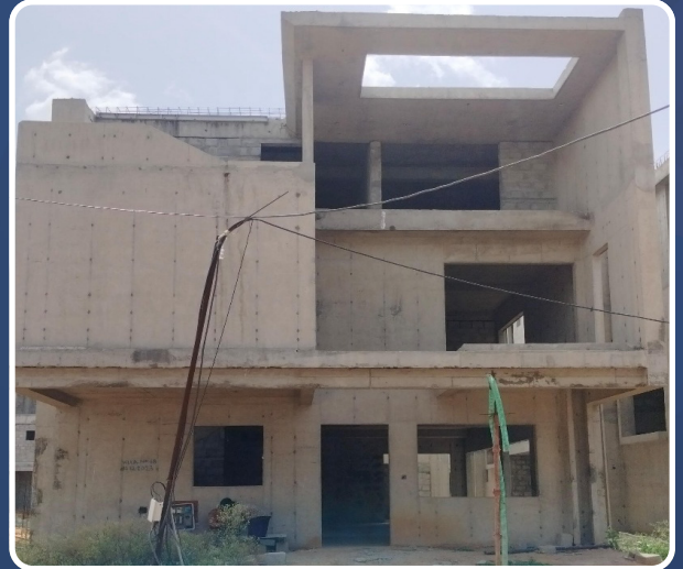
VILLA-68 (Structure Completed)