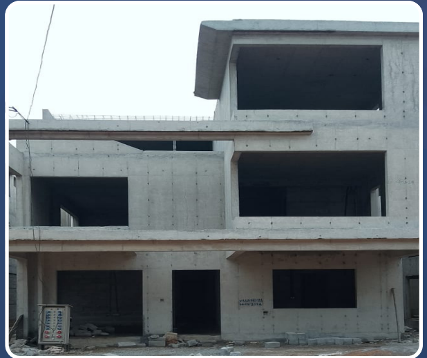
VILLA-111 (Structure Completed)