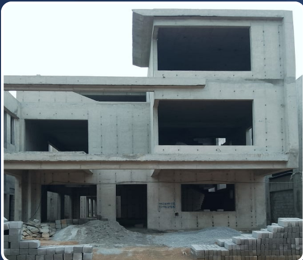
VILLA-112 (Structure Completed)