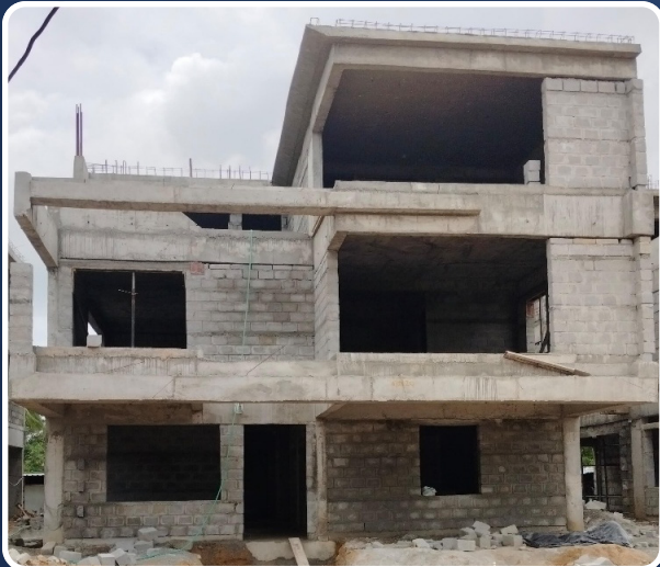
VILLA-49 (Structure Completed)