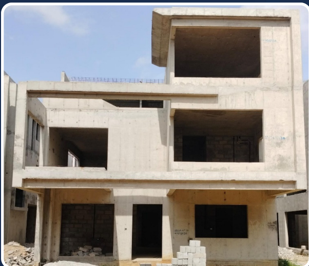
VILLA-84 (Structure Completed)