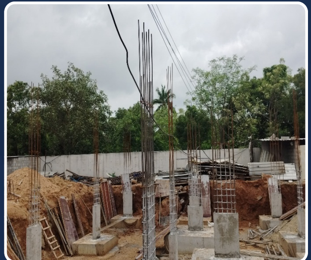
VILLA-53 (Pedestals Completed)