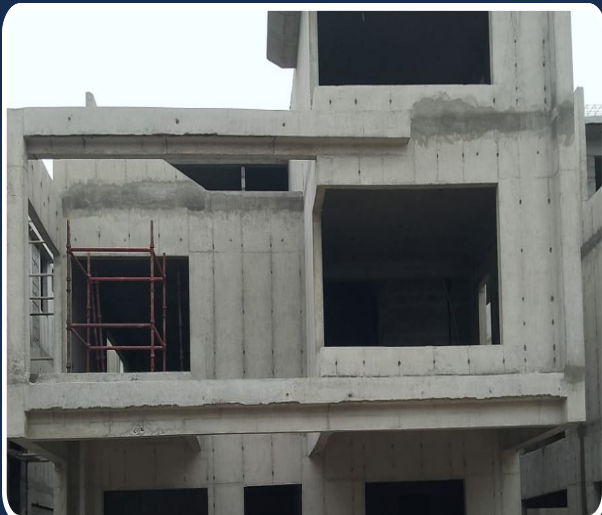
VILLA-120 (Structure Completed)