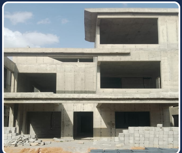
VILLA-175 (Structure Completed)