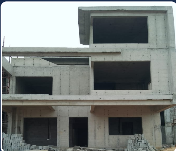
VILLA-144 (Structure Completed)