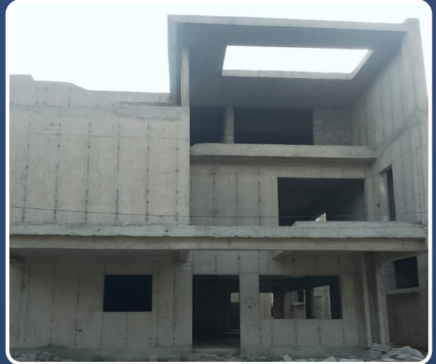
VILLA-99 (Structure Completed)