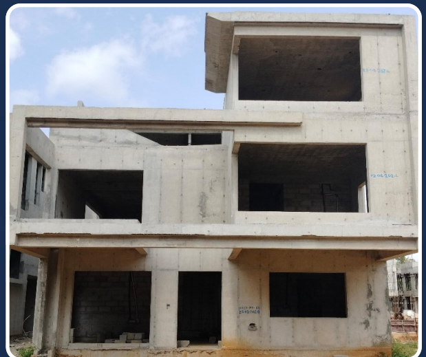
VILLA-85 (Structure Completed)