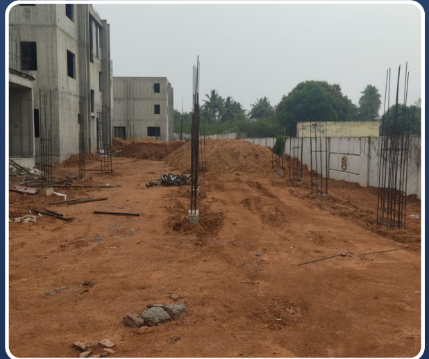
VILLA-179 (Pedestals Completed)