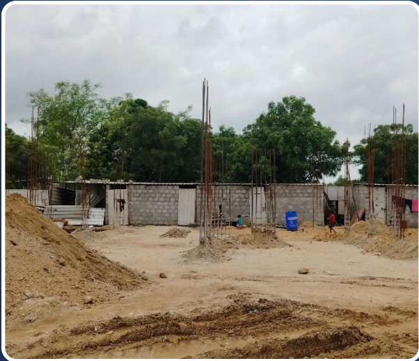
VILLA-54 (Pedestals Completed)