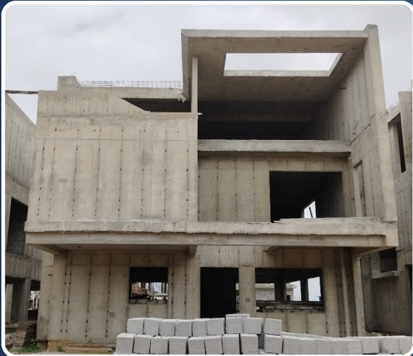
VILLA-29 (Structure Completed)