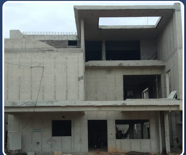
VILLA-64 (Structure Completed)