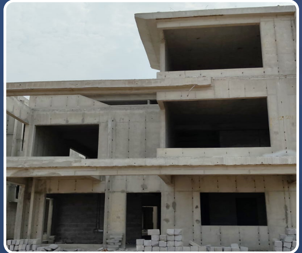
VILLA-141 (Structure Completed)