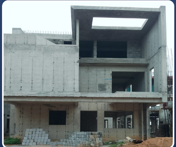
VILLA-107 (Structure Completed)