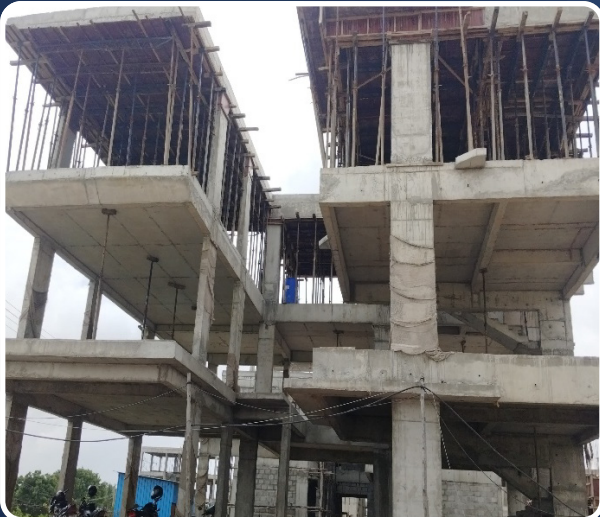
VILLA-43 (Structure Completed)