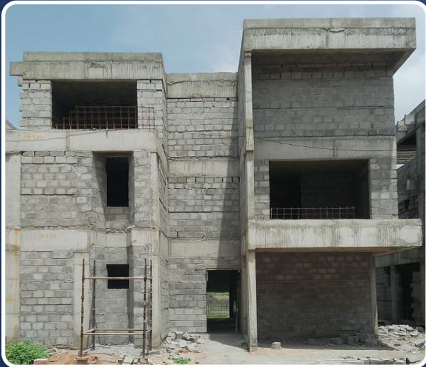
VILLA-182 (Structure Completed)