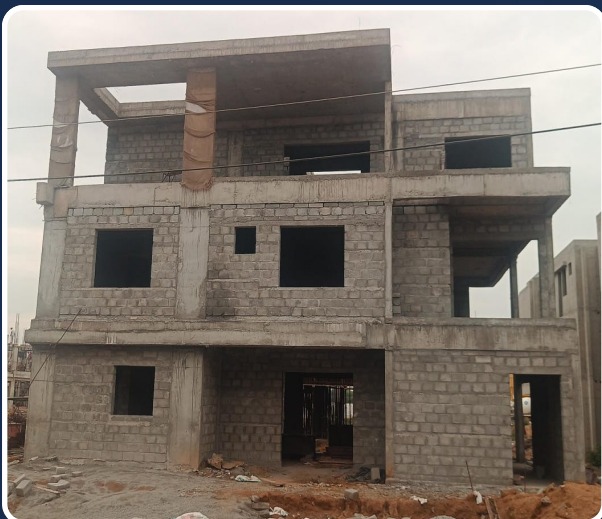
VILLA-132 (Structure Completed)