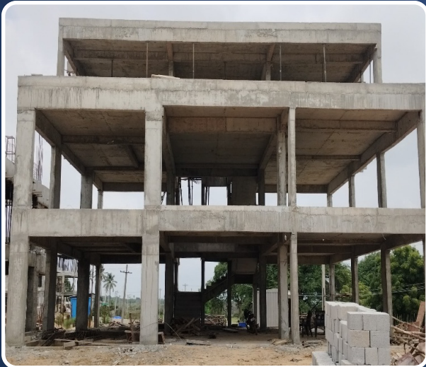
VILLA-17 (Structure Completed)