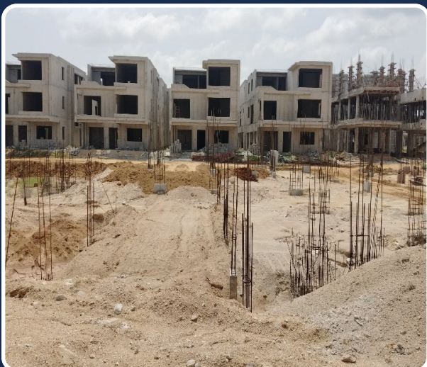
VILLA-168 (Pedestals Completed)