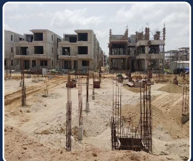
VILLA-169 (Pedestals Completed)