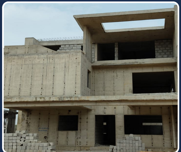
VILLA-133 (Structure Completed)