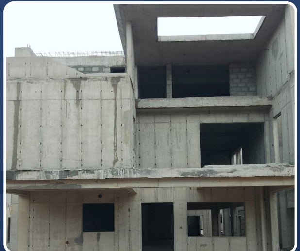
VILLA-95 (Structure Completed)