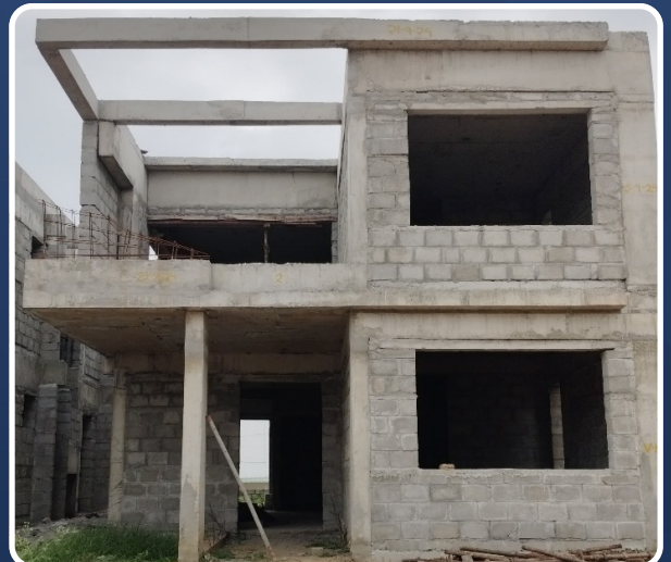
VILLA-4 (Structure Completed)