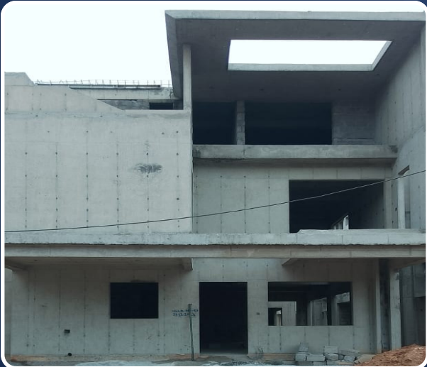
VILLA-69 (Structure Completed)