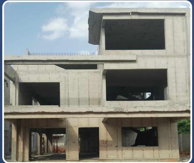
VILLA-123 (Structure Completed)