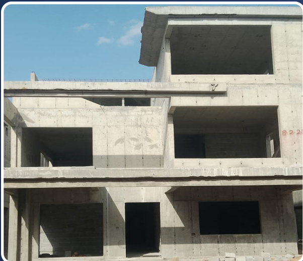
VILLA-148 (Structure Completed)