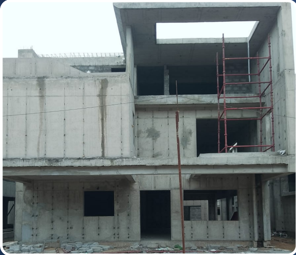
VILLA-98 (Structure Completed)