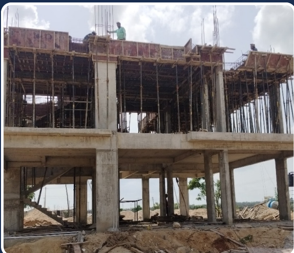
VILLA-77 (FF Slab Completed)