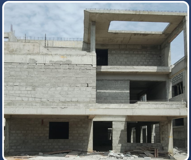
VILLA-38 (Structure Completed)