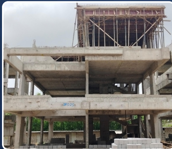
VILLA-190 (SF Slab Completed)