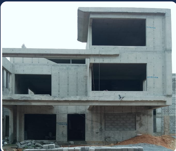
VILLA-114 (Structure Completed)