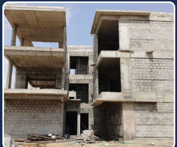
VILLA-79 (Structure Completed)