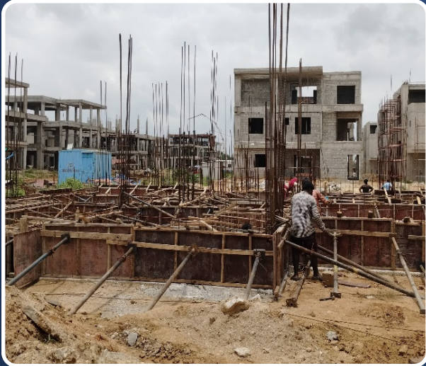
VILLA-67 (Plinth PCC Completed)