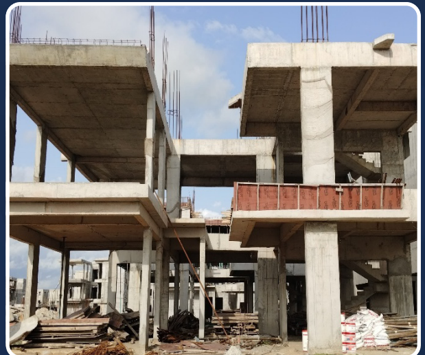
VILLA-139 (FF Slab Completed)