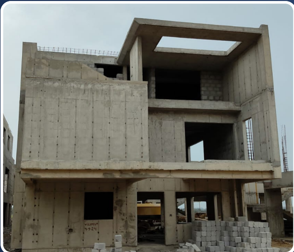
VILLA-160 (Structure Completed)