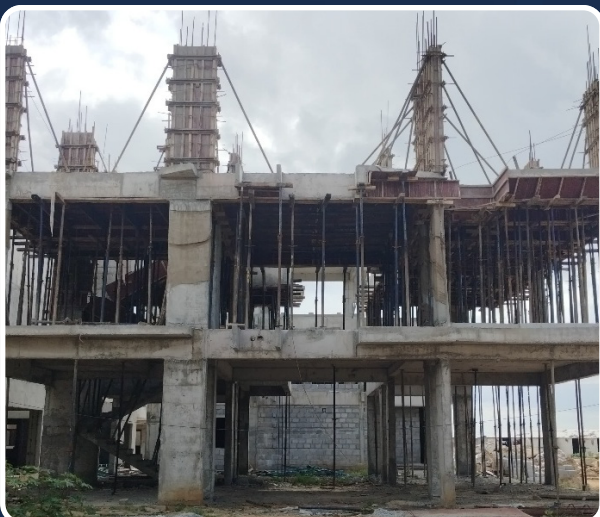
VILLA-108 (FF Slab Completed)