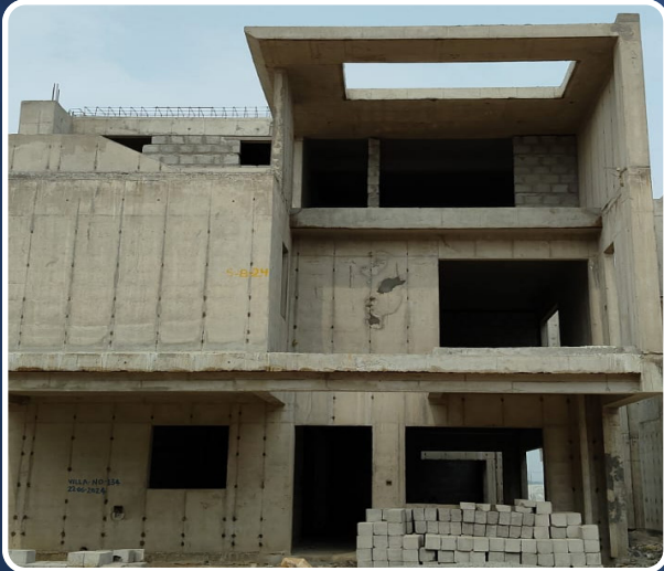
VILLA-134 (Structure Completed)