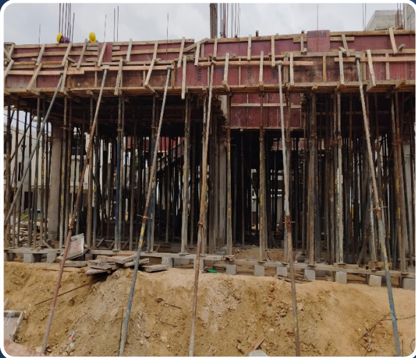
VILLA-41 (GF Columns Completed)