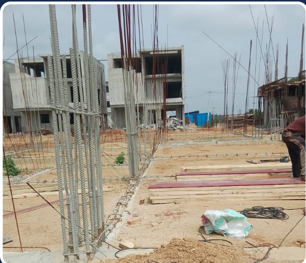
VILLA-14 (Plinth Beam Completed)