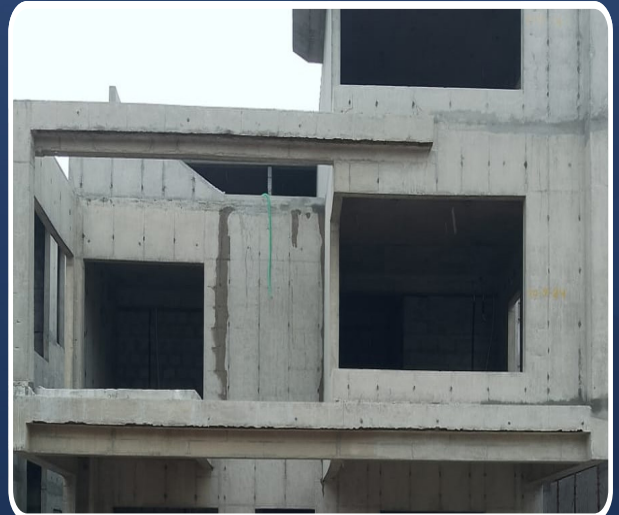
VILLA-119 (Structure Completed)