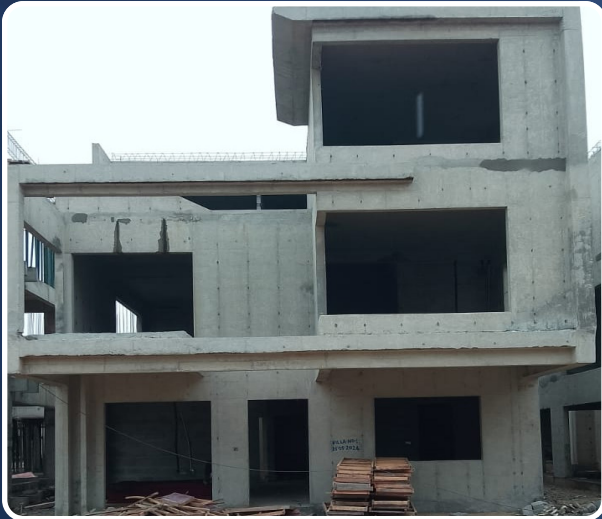
VILLA-110 (Structure Completed)