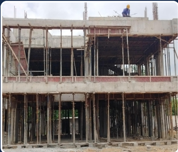
VILLA-51 (FF Slab Completed)