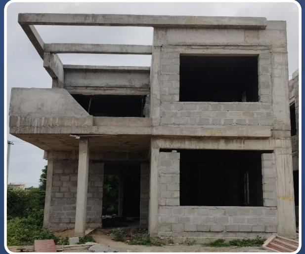
VILLA-2 (Structure Completed)