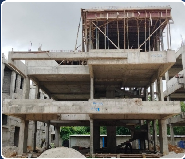
VILLA-188 (SF Slab Completed)