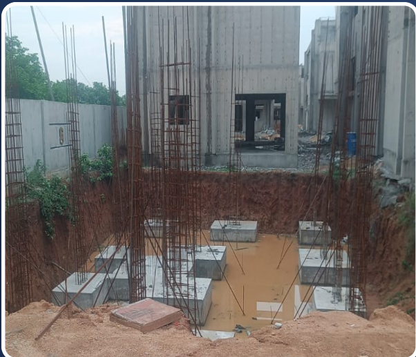
VILLA-94 (Footings Completed)