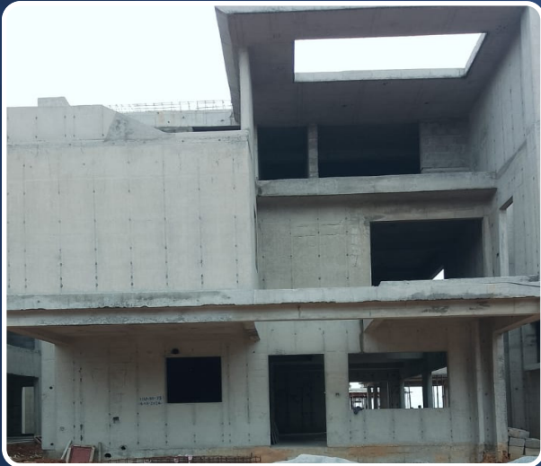
VILLA-73 (Structure Completed)