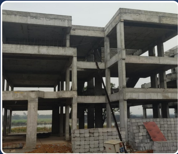
VILLA-184 (Structure Completed)