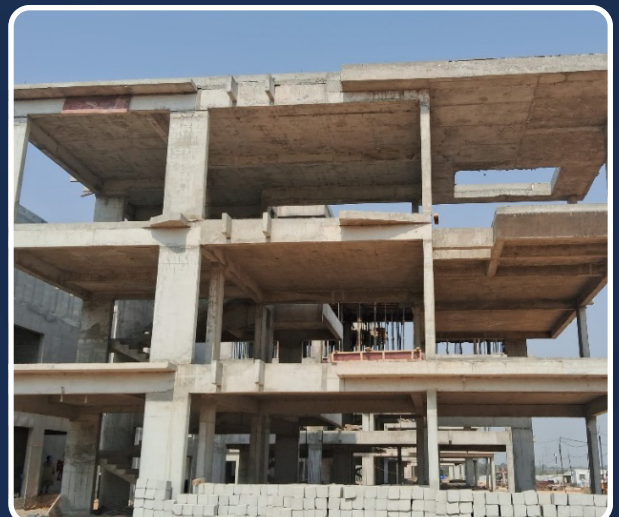
VILLA-66 (Structure Completed)