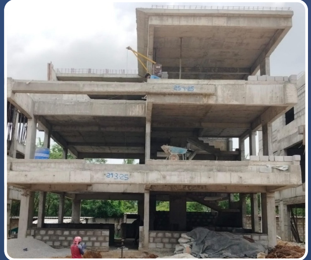
VILLA-48 (Structure Completed)