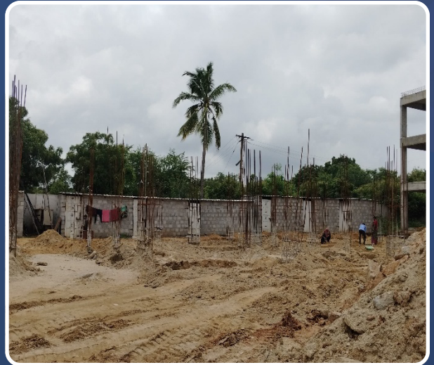
VILLA-55 (Backfilling Completed)