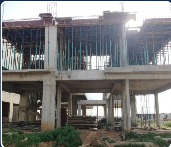
VILLA-138 (FF Columns Completed)