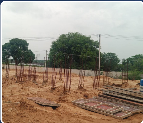
VILLA-31 (Pedestals Completed)