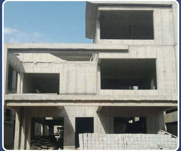
VILLA-177 (Structure Completed)