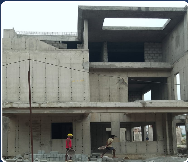
VILLA-130 (Structure Completed)