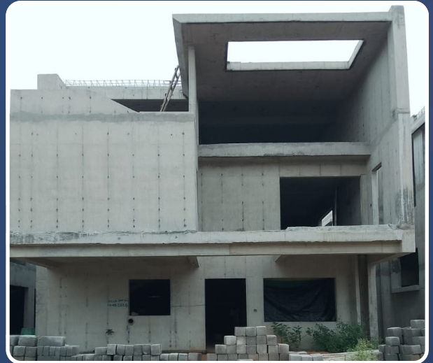
VILLA-62 (Structure Completed)