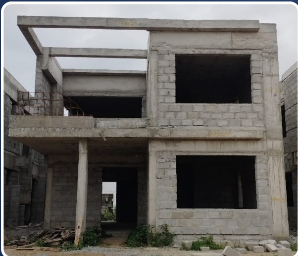
VILLA-3 (Structure Completed)