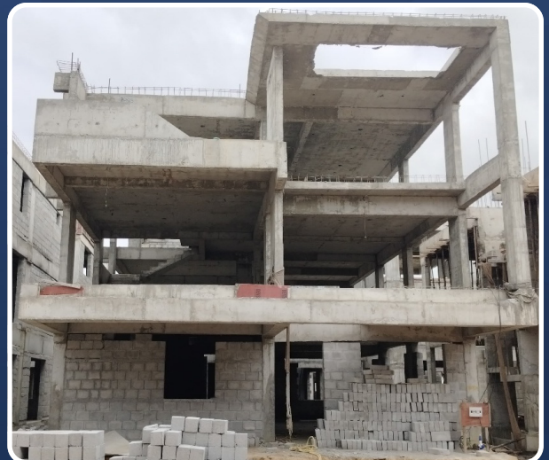
VILLA-26 (Structure Completed)