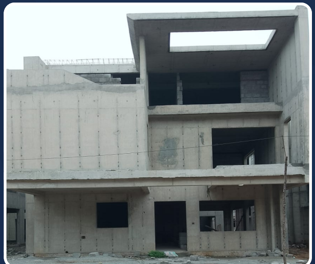
VILLA-97 (Structure Completed)