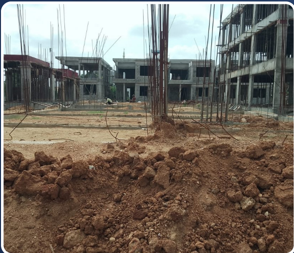
VILLA-19 (Plinth Beam Completed)