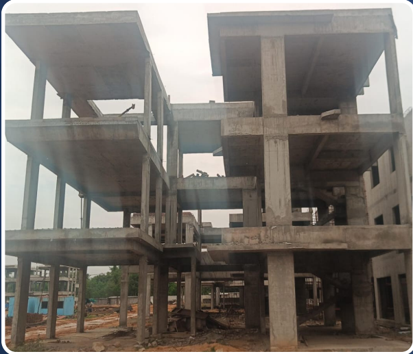
VILLA-116 (Structure Completed)