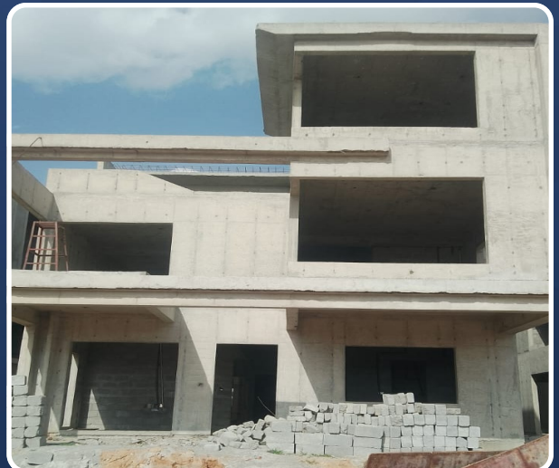
VILLA-143 (Structure Completed)