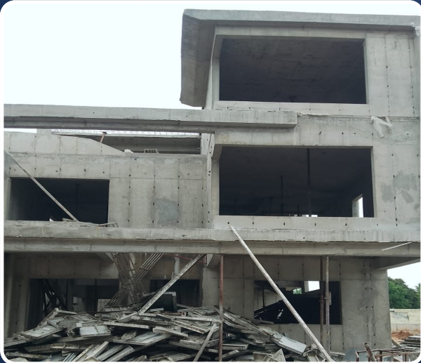
VILLA-178 (Structure Completed)