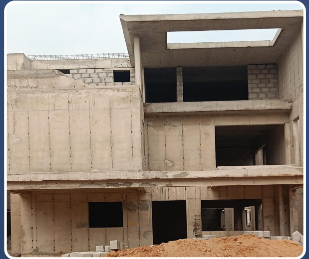
VILLA-159 (Structure Completed)