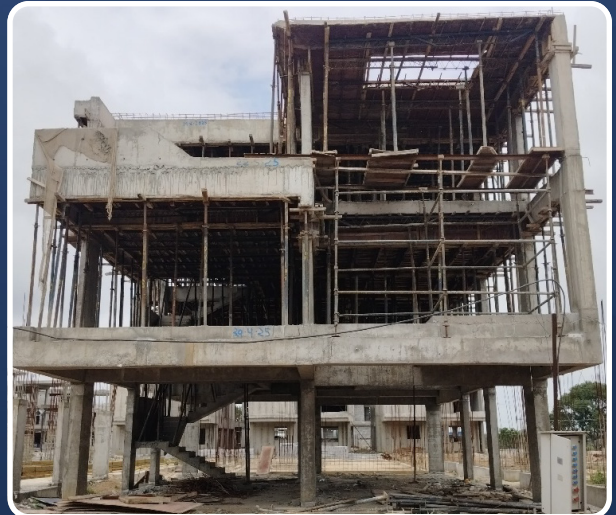
VILLA-13 (Structure Completed)