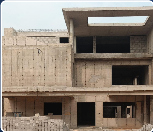
VILLA-158 (Structure Completed)