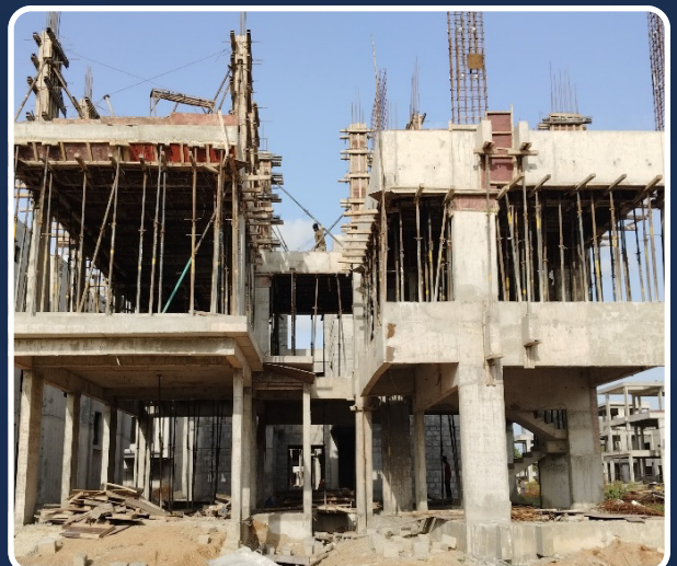
VILLA-145 (FF Slab Completed)