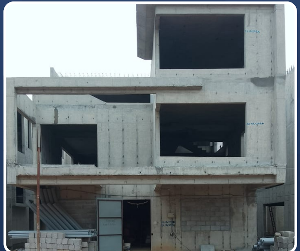
VILLA-113 (Structure Completed)