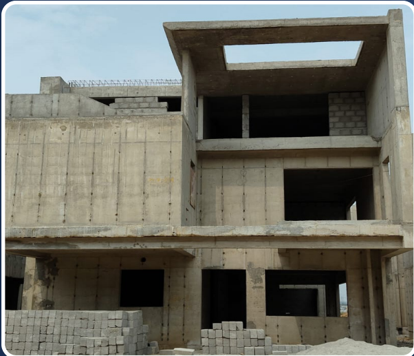
VILLA-136 (Structure Completed)