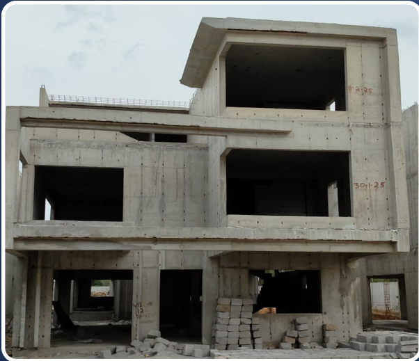
VILLA-122 (Structure Completed)