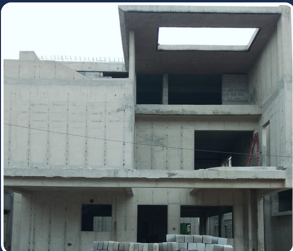
VILLA-96 (Structure Completed)