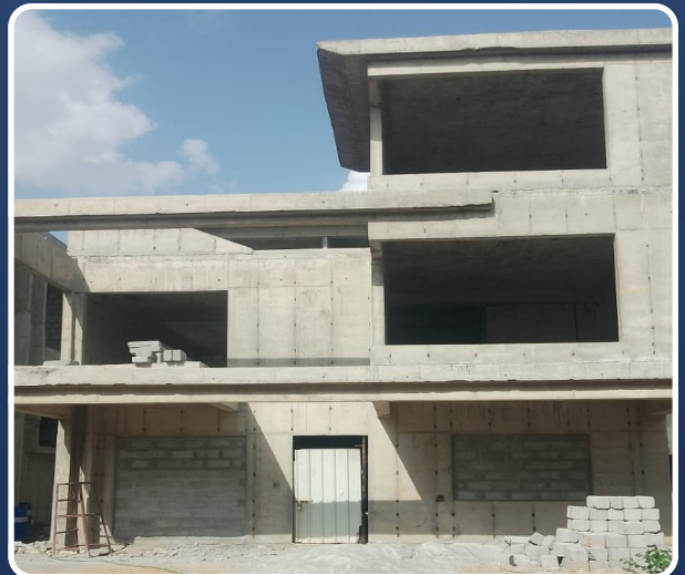
VILLA-173 (Structure Completed)