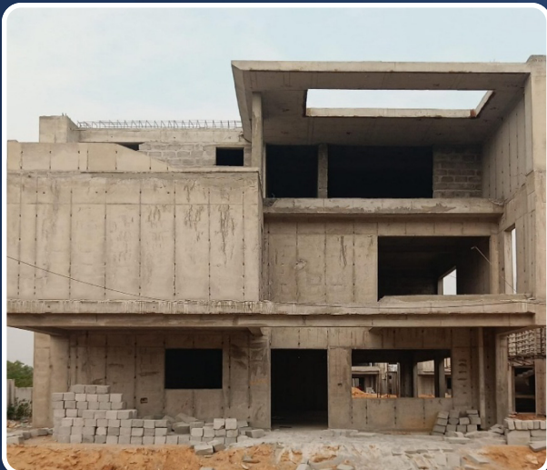
VILLA-124 (Structure Completed)