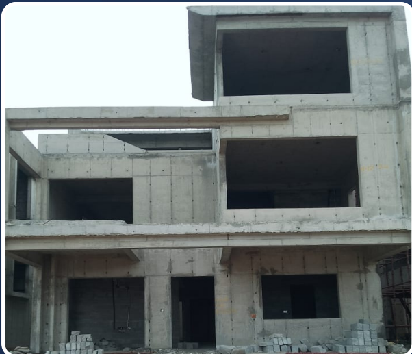
VILLA-142 (Structure Completed)