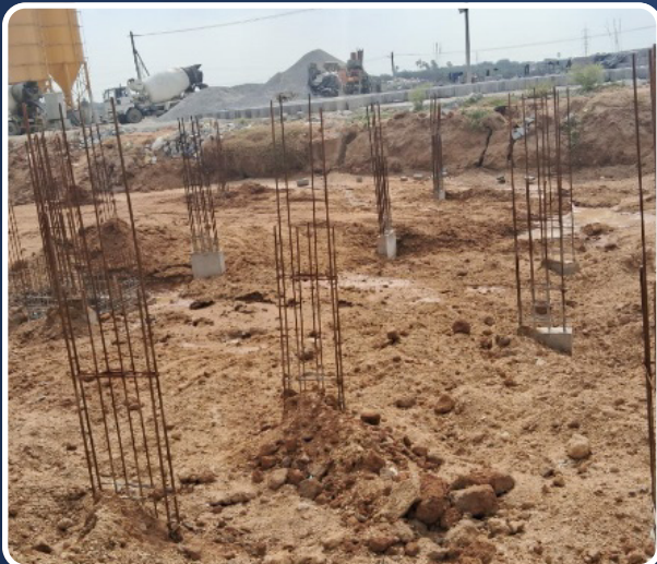
VILLA-166 (Pedestals Completed)