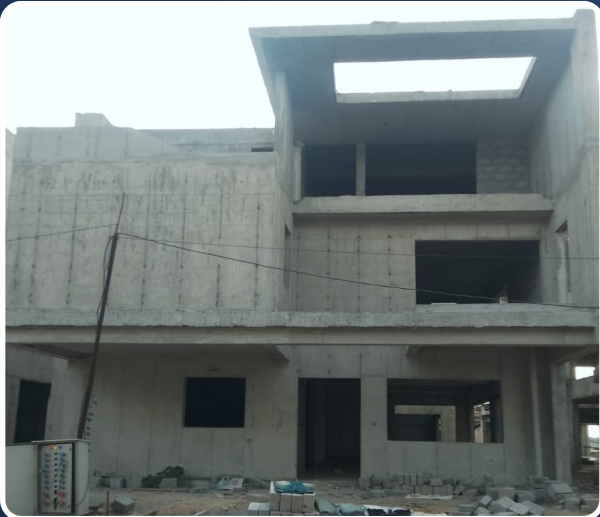
VILLA-100 (Structure Completed)