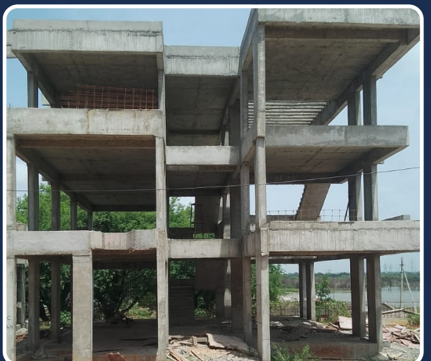
VILLA-187 (Structure Completed)