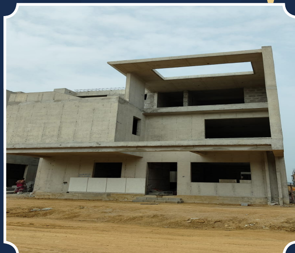
VILLA-72 (Structure completed)