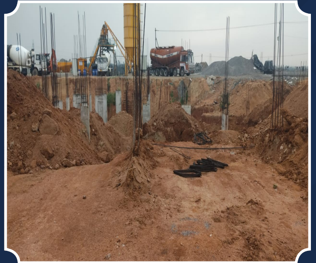
VILLA-164 (Pedestals Completed)