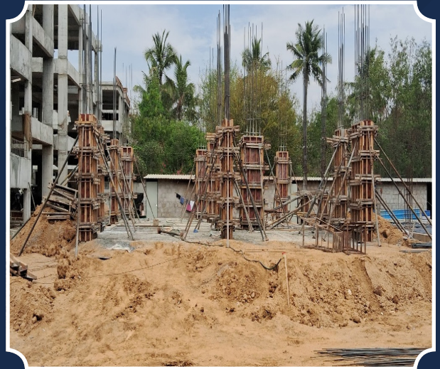
VILLA-188 (GF Columns Completed)