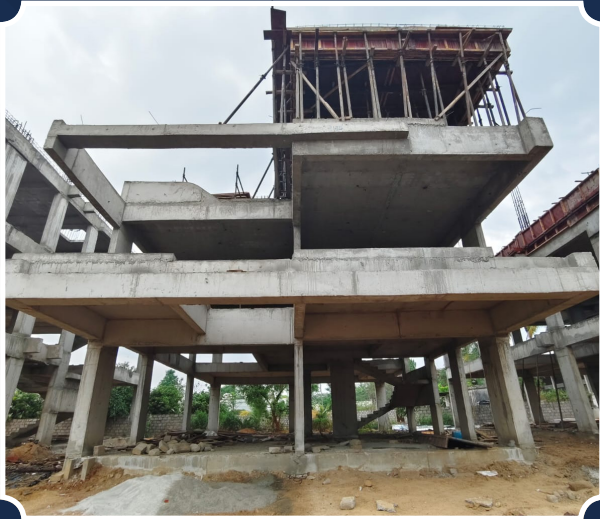
VILLA-7 (Structure Completed)