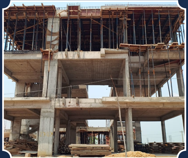
VILLA-42 (SF Slab in Progress)