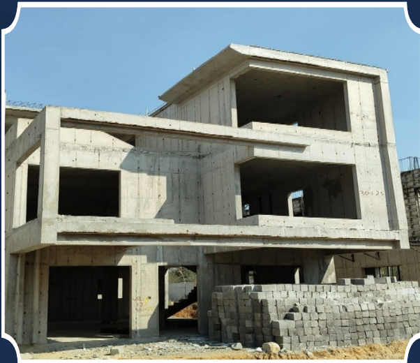
VILLA-122 (Structure completed)