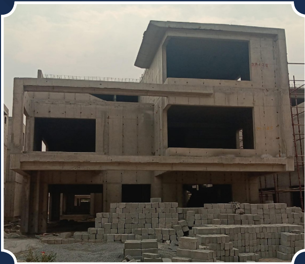
VILLA-120 (Structure completed)