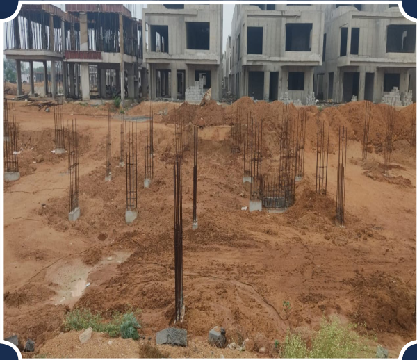
VILLA-165 (Pedestals Completed)