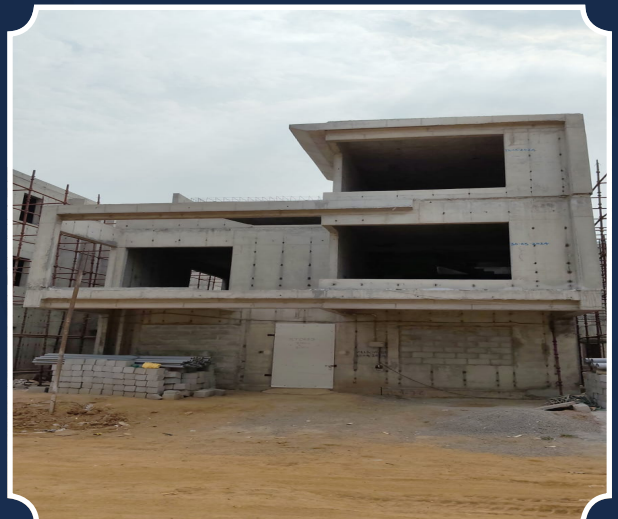
VILLA-113 (Structure Completed)