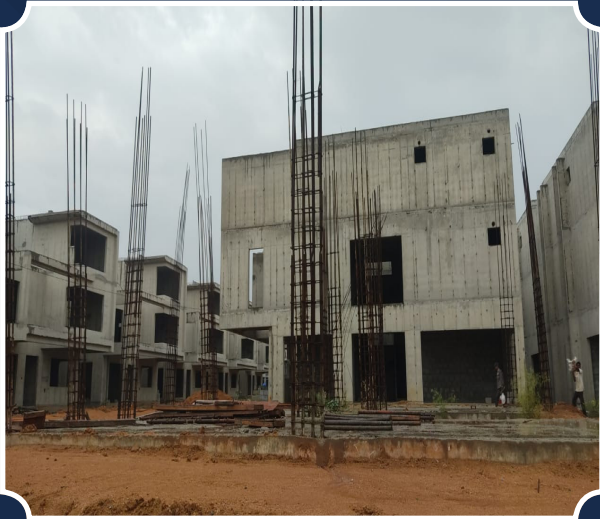
VILLA-108 (Grade Slab Completed)