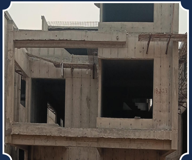
VILLA-149 (Structure completed)