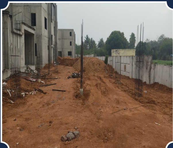
VILLA-179 (Pedestals Completed)