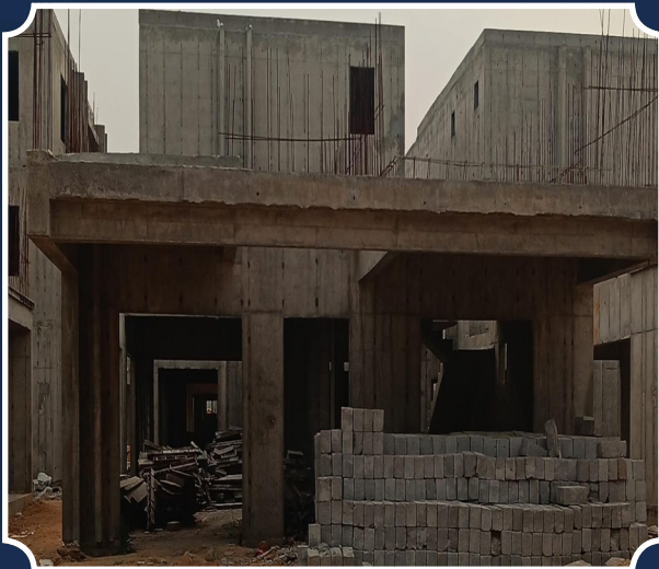
VILLA-177 (Gf slab Completed)