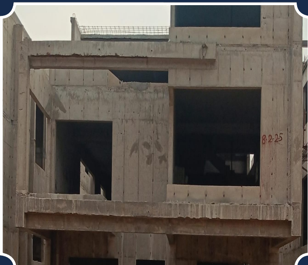
VILLA-148 (Structure completed)