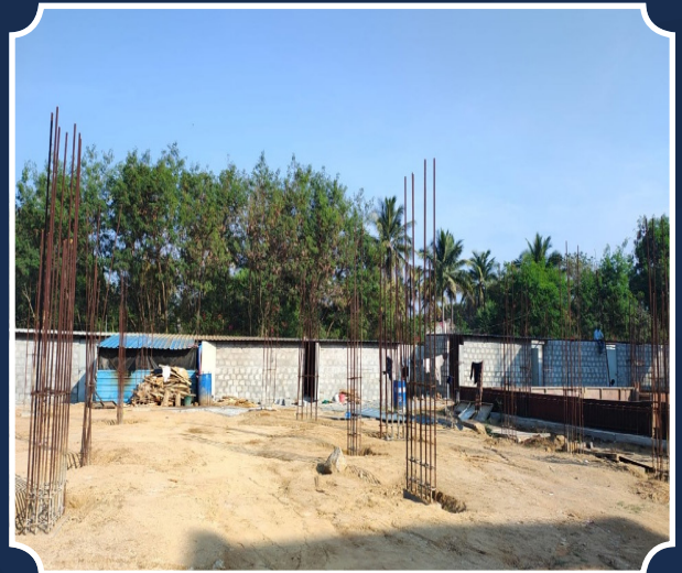
VILLA-190 (Back Filling Completed)