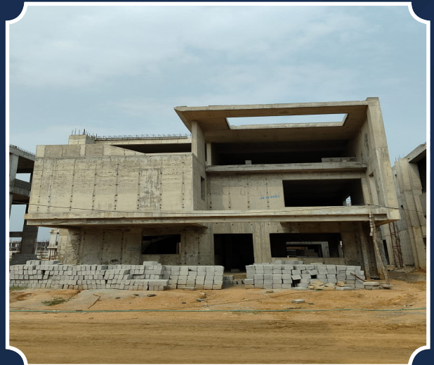
VILLA-103 (Structure completed)