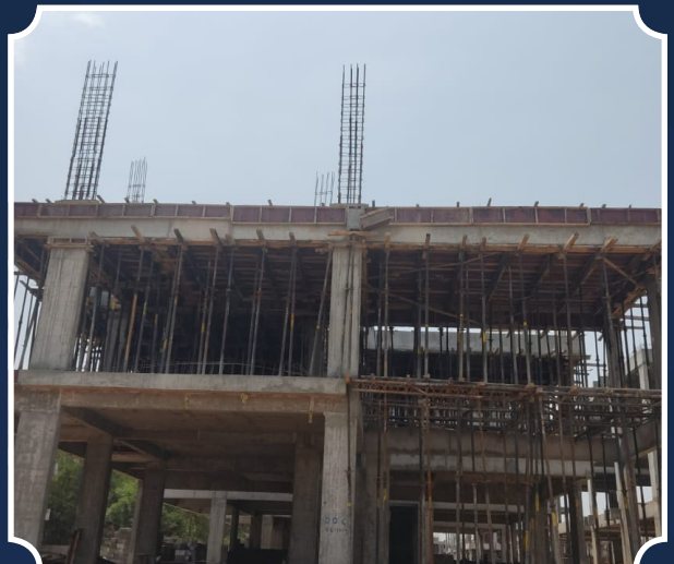
VILLA-40 (FF Slab completed)