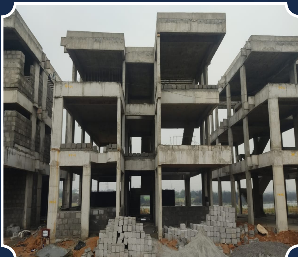
VILLA-185 (Sf slab Completed)