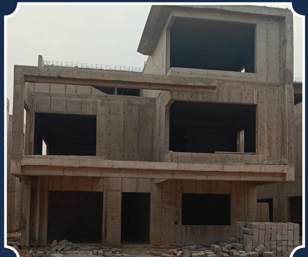
VILLA-174 (Structure Completed)