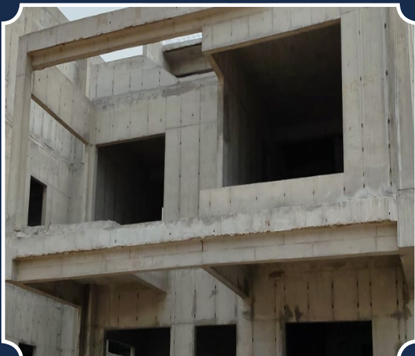
VILLA-142 (Structure Completed)