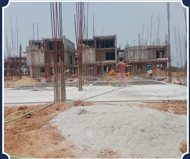
VILLA-13 (GRADE SLAB Completed)