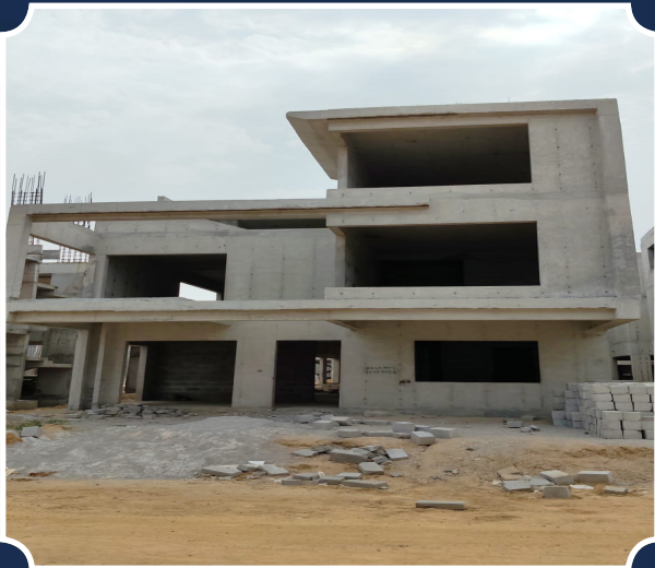
VILLA-110 (Structure completed)