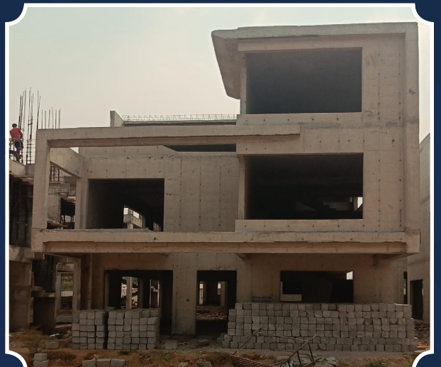
VILLA-88 (Structure Completed)