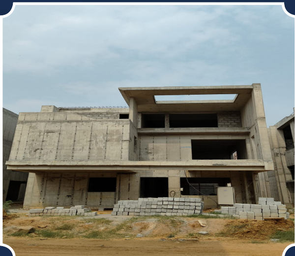
VILLA-104 (Structure completed)