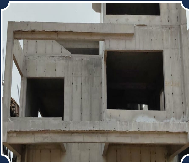
VILLA-140 (Structure completed)