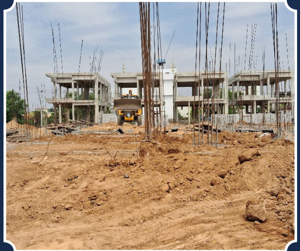
VILLA-18 (Back Filling Completed)