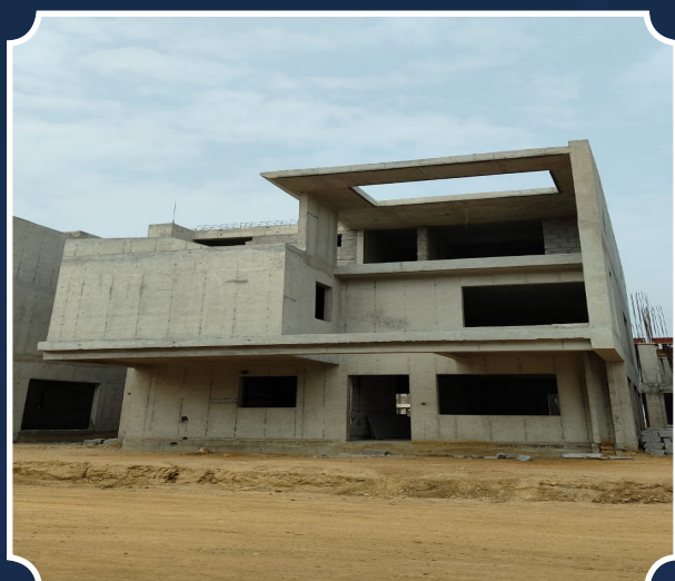
VILLA-75 (Structure completed)