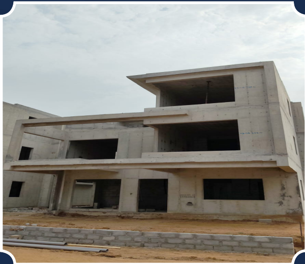
VILLA-85 (Structure completed)