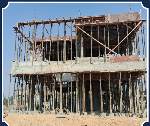
VILLA-34 (FF Walls Completed)