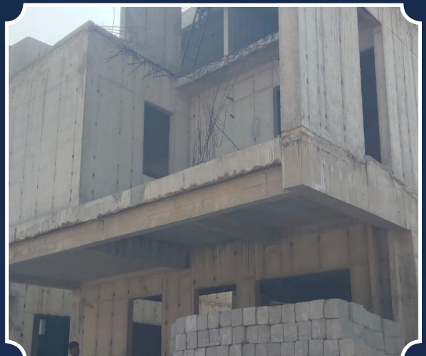
VILLA-137 (Structure completed)