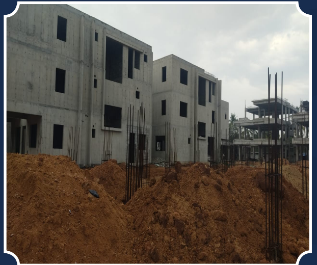
VILLA-86 (Backfilling Completed)