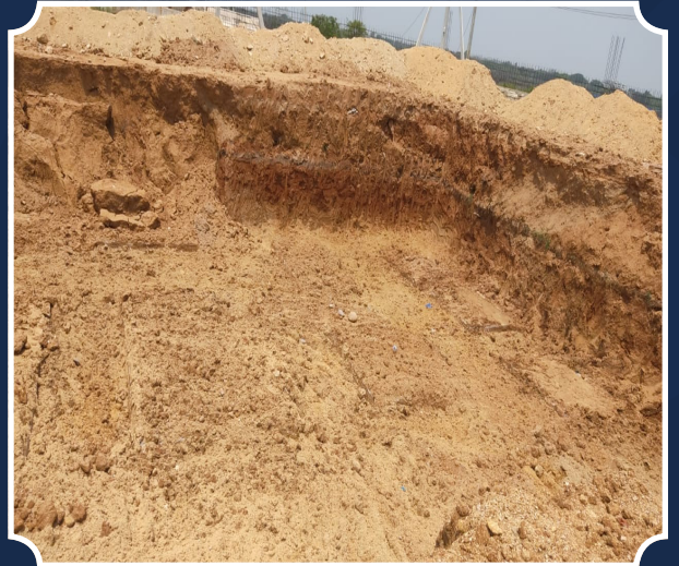
VILLA-78 (Excavation Completed)