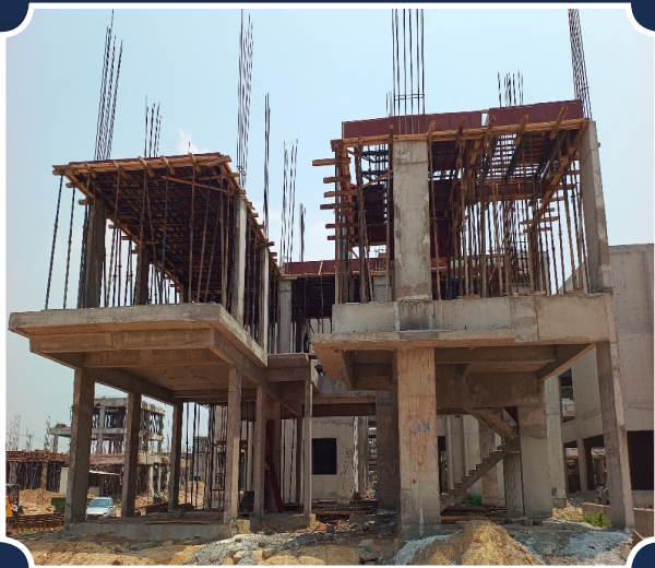
VILLA-79 (FF Columns Completed)