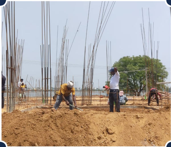
VILLA-17 (Grade Slab Completed)