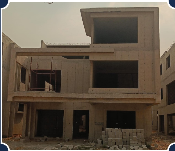
VILLA-89 (Structure completed)