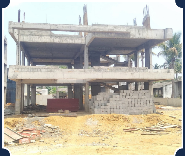
VILLA-24 (SF Columns Completed)