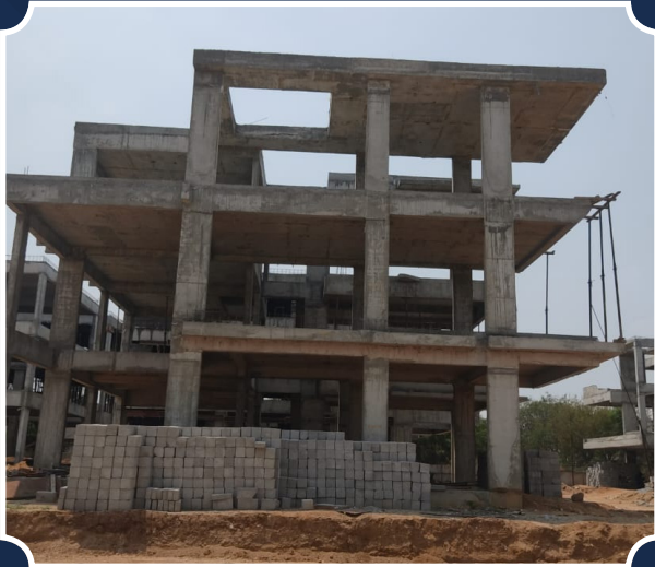
VILLA-35 (Structure Completed)