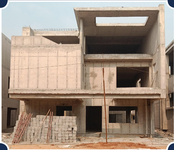
VILLA-98 (Structure completed)