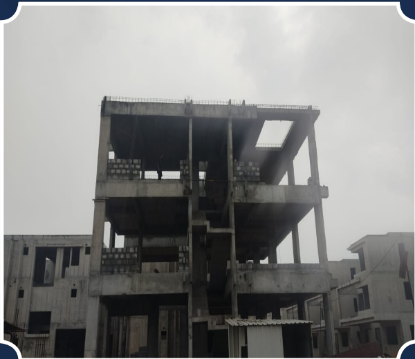
VILLA-102 (Structure completed)