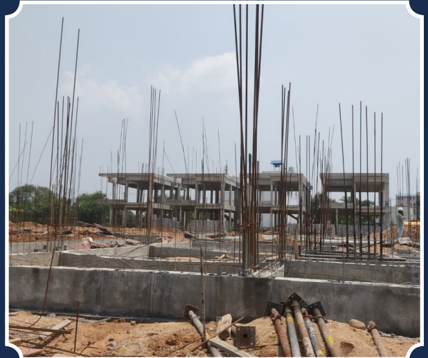
VILLA-20 (Plinth Beam Completed)