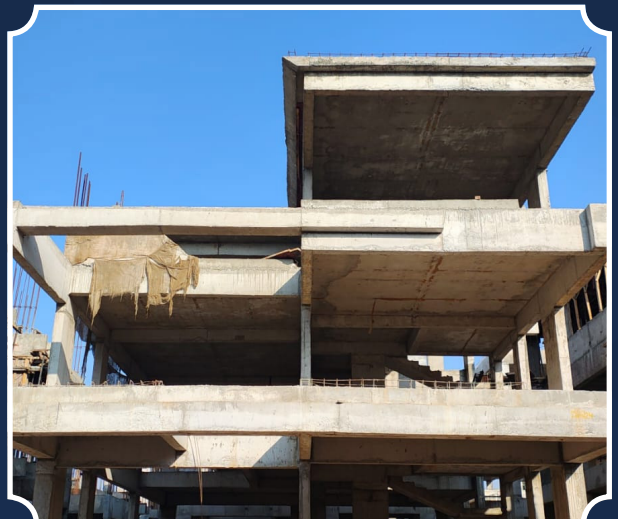
VILLA-46 (Structure completed)