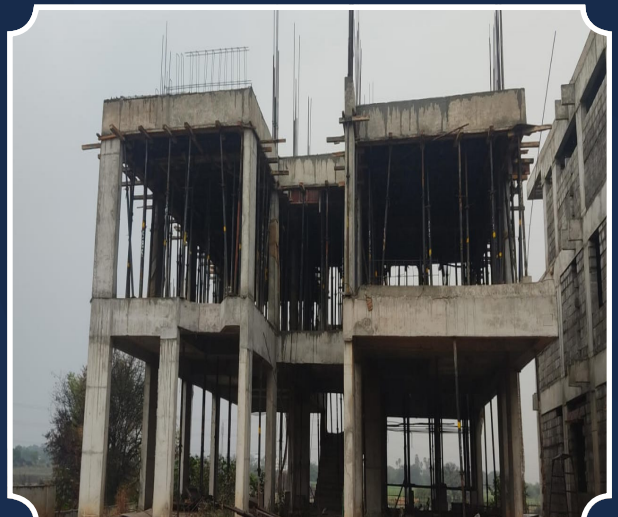
VILLA-180 (FF Slab Completed)