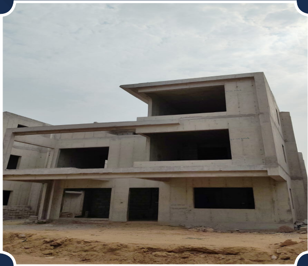
VILLA-83 (Structure completed)