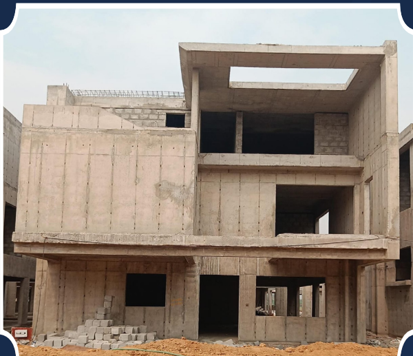
VILLA-155 (Structure Completed)