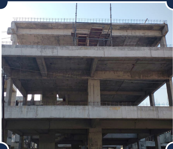
VILLA-39 (Structure completed)