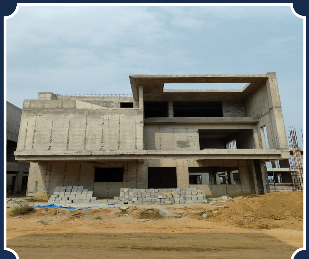
VILLA-107 (Structure completed)