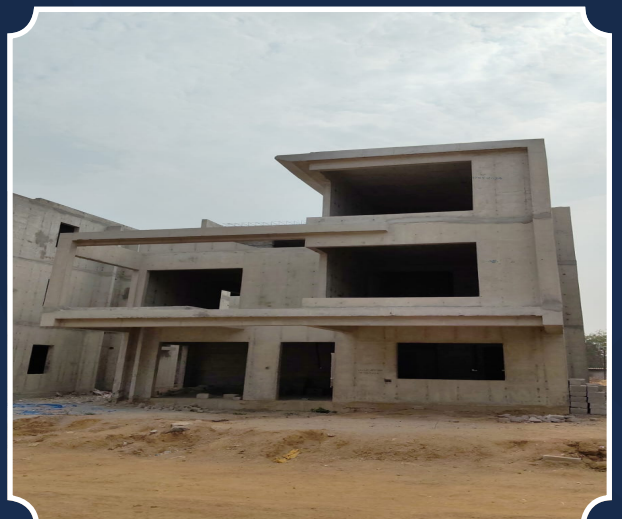
VILLA-82 (Structure completed)