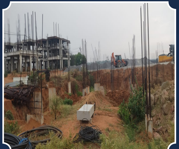
VILLA-162 (Pedestals Completed)