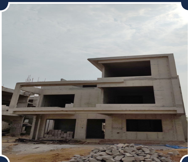
VILLA-81 (Structure completed)