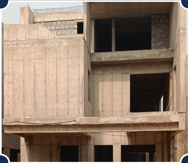
VILLA-157 (Structure completed)