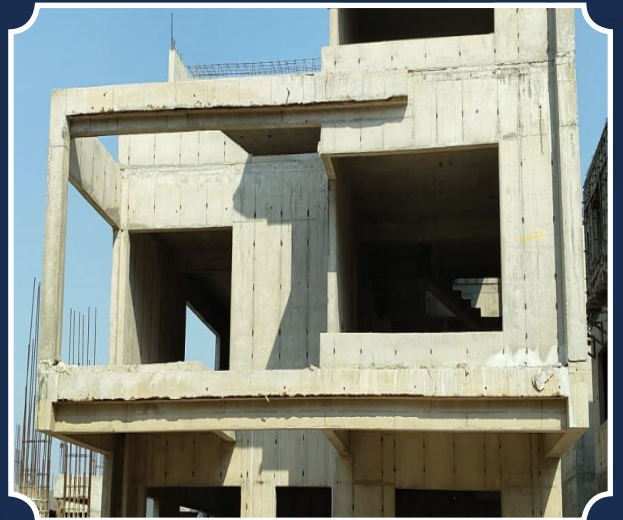
VILLA-147 (Structure completed)