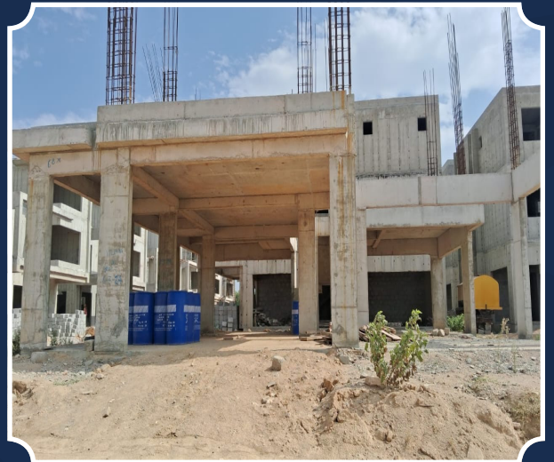
VILLA-160 (Gf Slab Completed)