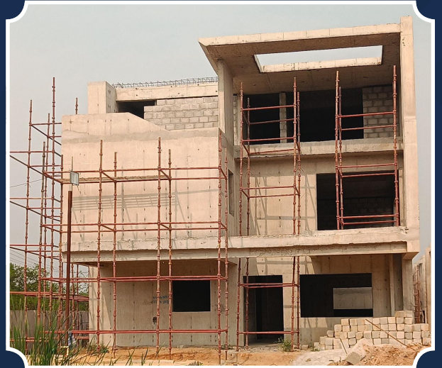
VILLA-60 (Structure completed)