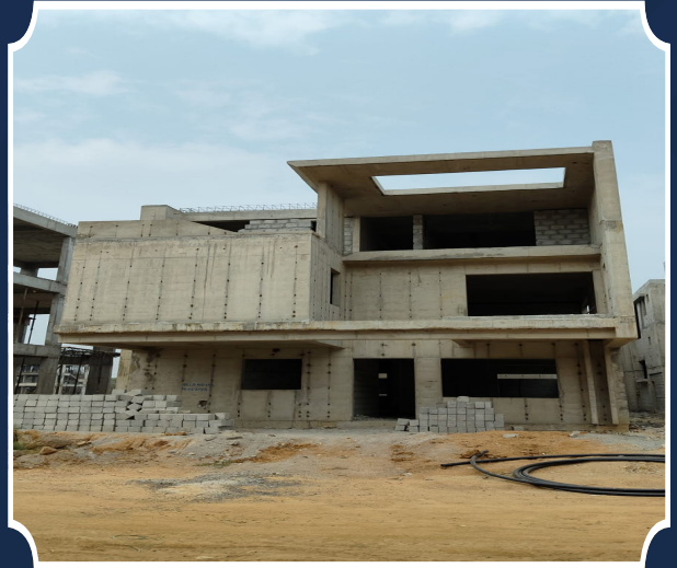
VILLA-133 (Structure completed)