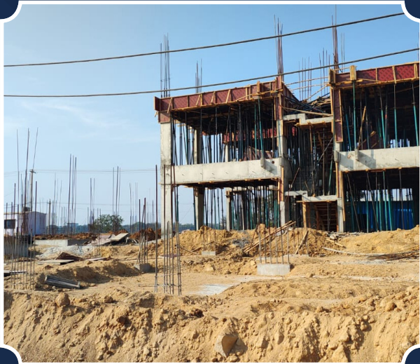
VILLA-41 (SF Walls completed)