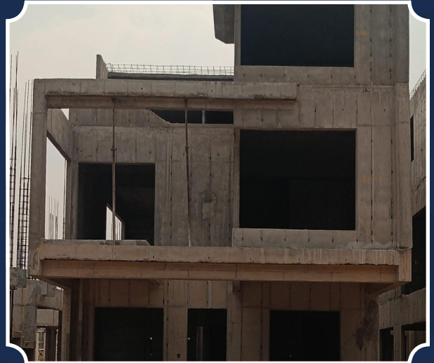
VILLA-172 (Structure Completed)