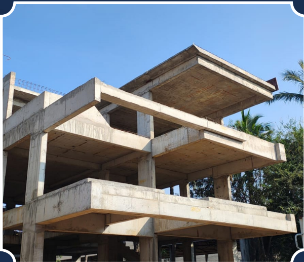
VILLA-37 (Structure Completed)