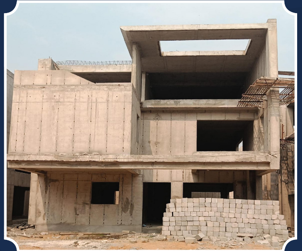
VILLA-99 (Structure completed)