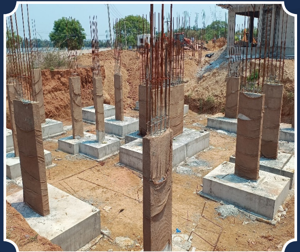
VILLA-32 (Pedestals Completed)