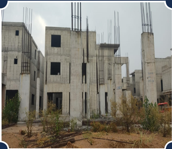
VILLA-146 (GF Columns completed)