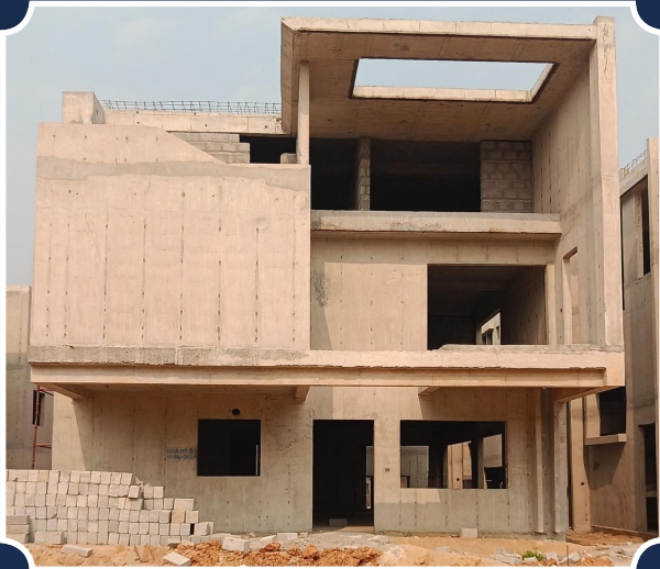
VILLA-61 (Structure completed)