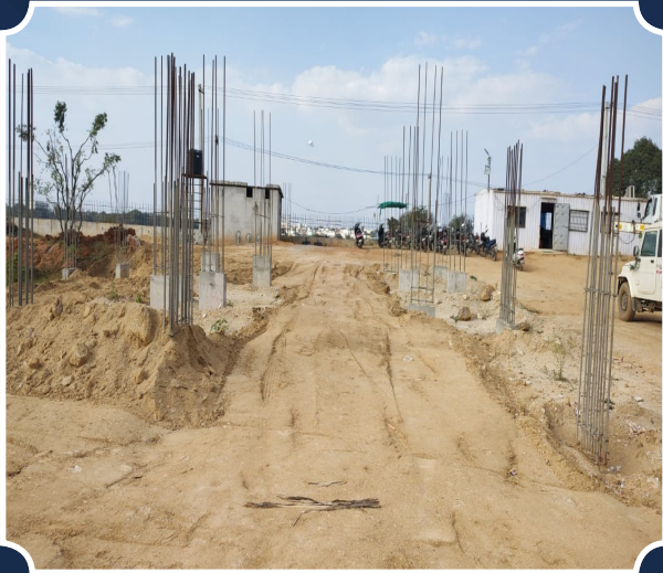
VILLA-77 (Plinth pcc Completed)