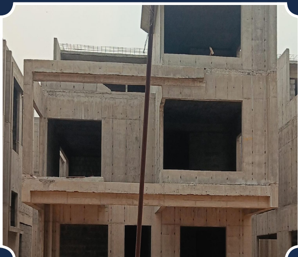
VILLA-173 (Structure Completed)