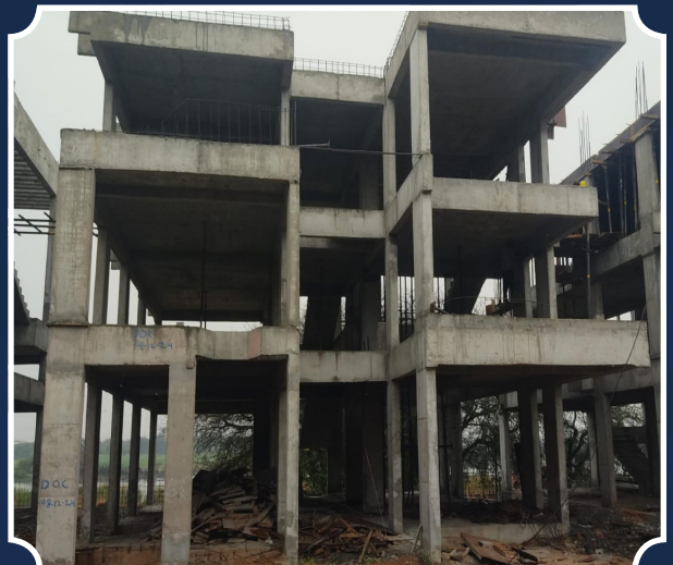
VILLA-186 (SF slab Completed)