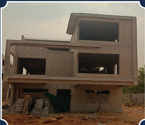
VILLA-93 (Structure completed)