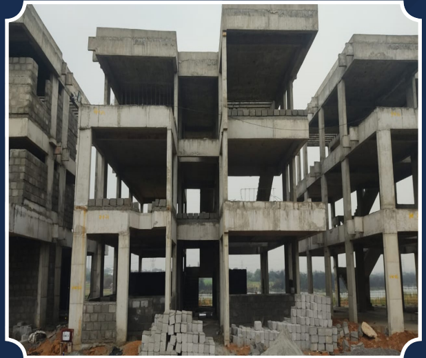
VILLA-182 (Structure Completed)