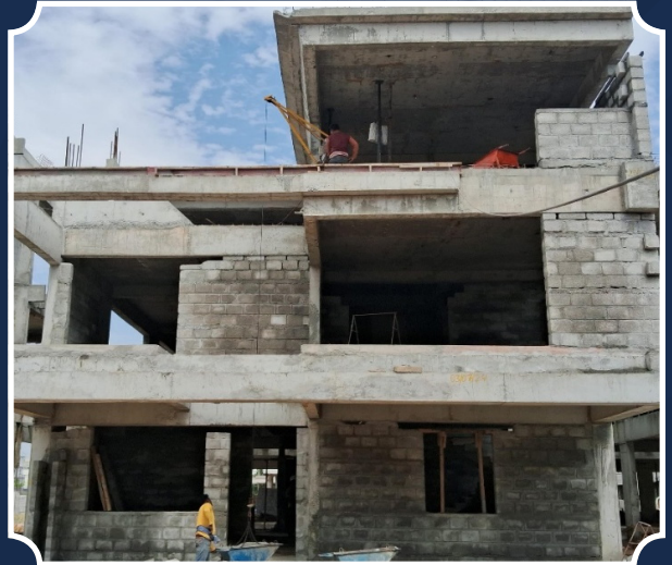
VILLA-36 (Structure Completed)