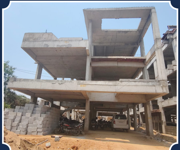
VILLA-38 (Structure completed)