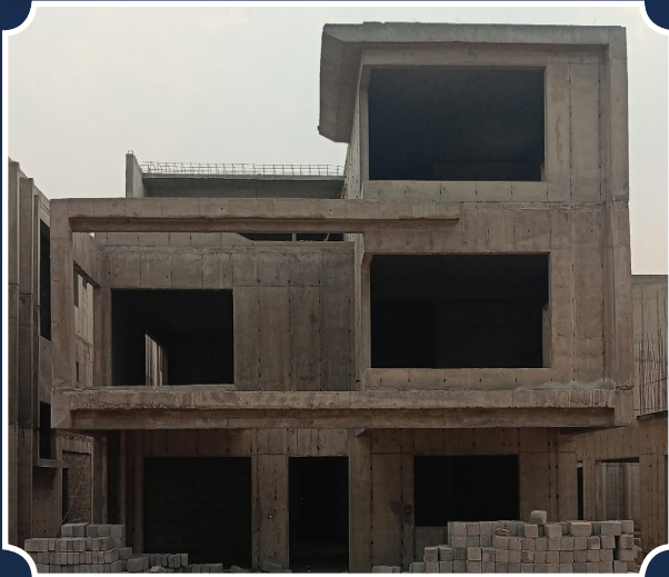
VILLA-175 (Structure Completed)