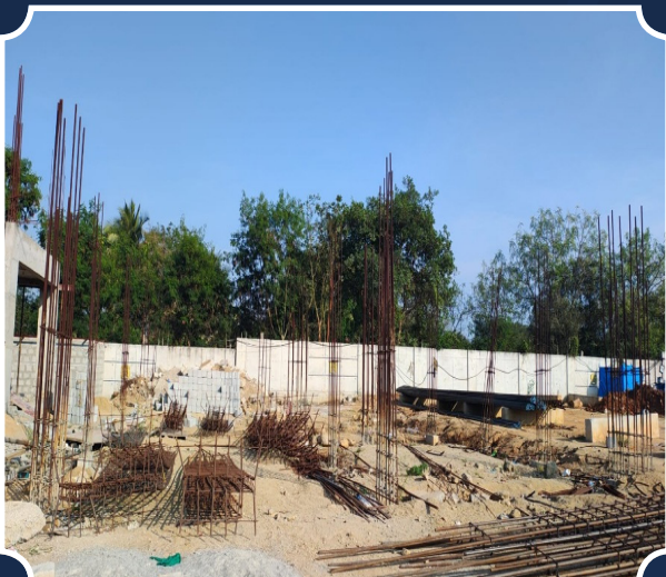
VILLA-51 (Backfilling Completed)