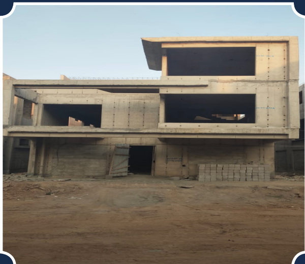
VILLA-112 (Structure completed)