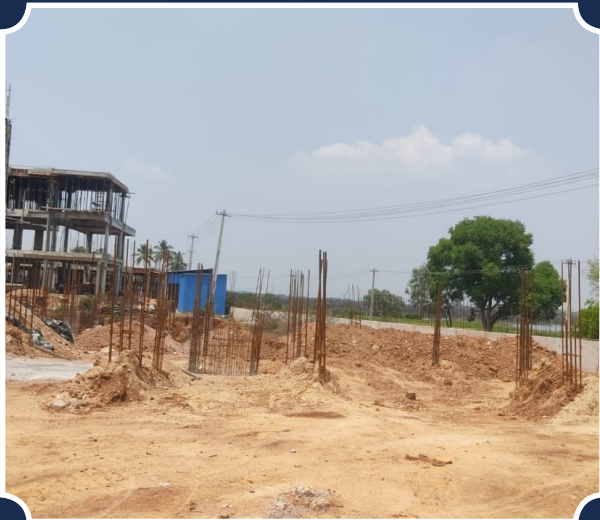
VILLA-31 (Pedestals Completed)