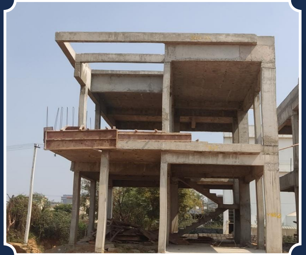
VILLA-2 (Structure Completed)