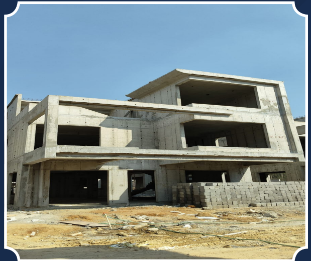
VILLA-121 (Structure Completed)