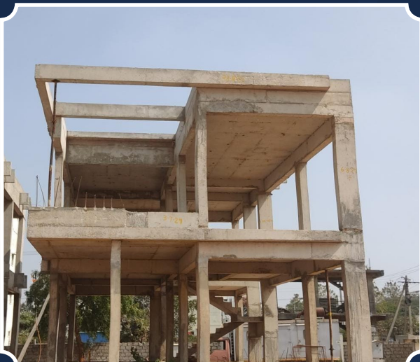
VILLA-5 (Structure Completed)