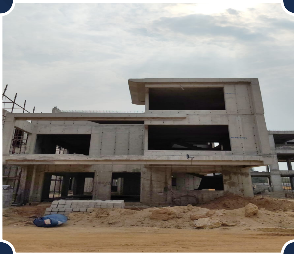
VILLA-114 (Structure completed)