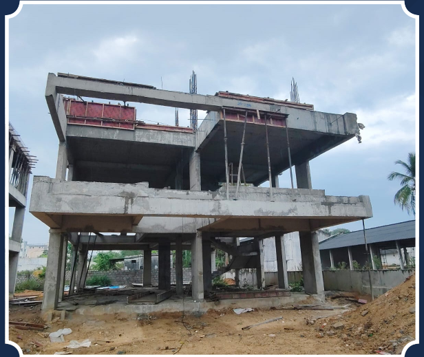
VILLA-8 (First Floor slab Completed)