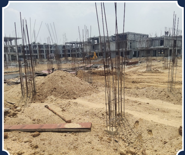
VILLA-15 (BACK FILLING Completed)