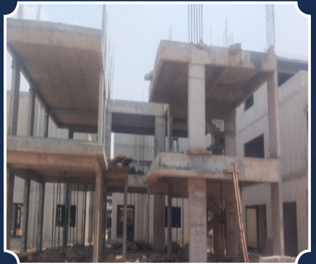
VILLA-80 (FF Slab Completed)