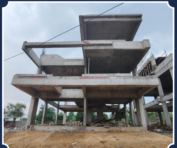
VILLA-6 (Structure Completed)