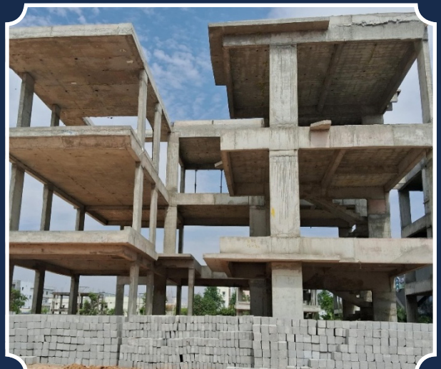
VILLA-22 (Structure Completed)