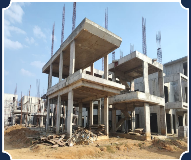
VILLA-109 (FF Slab Completed)