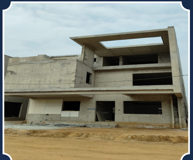
VILLA-70 (Structure completed)