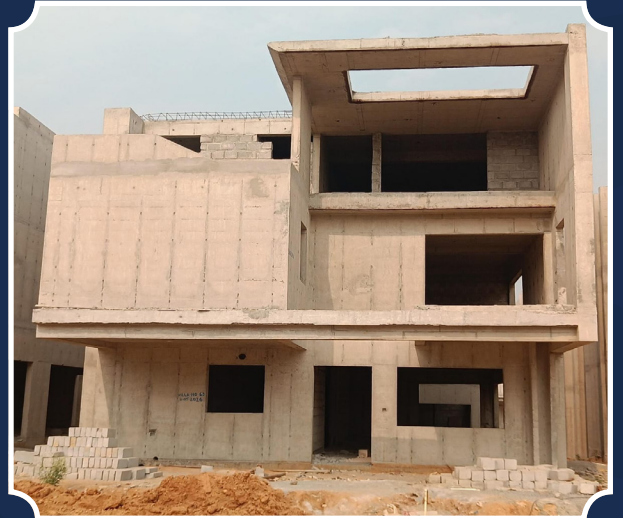
VILLA-62 (Structure completed)