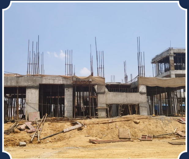
VILLA-44 (Gf Slab Completed)