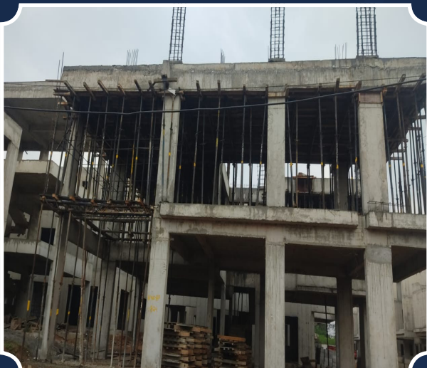
VILLA-87 (SF Columns Completed)