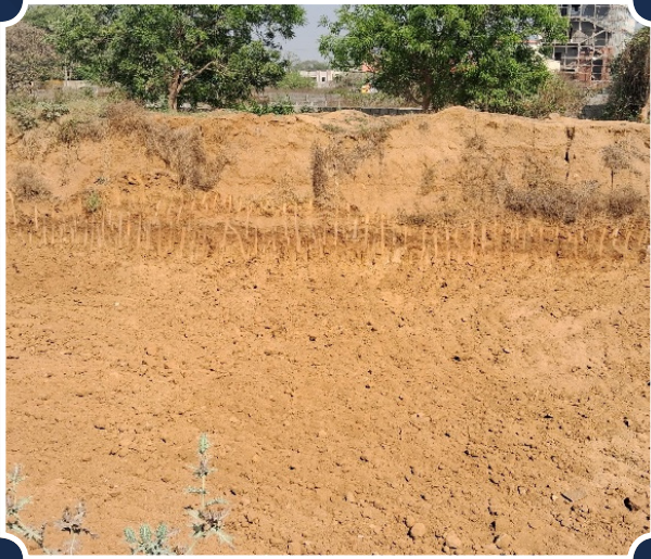
VILLA-1 (Excavation Completed)