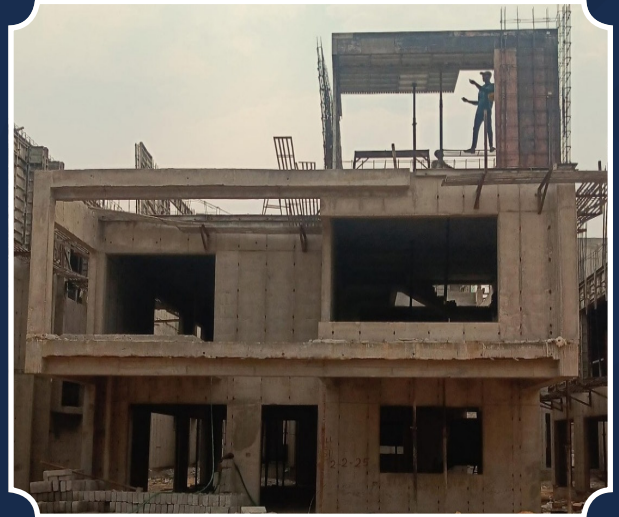
VILLA-151 (FF slab Completed)