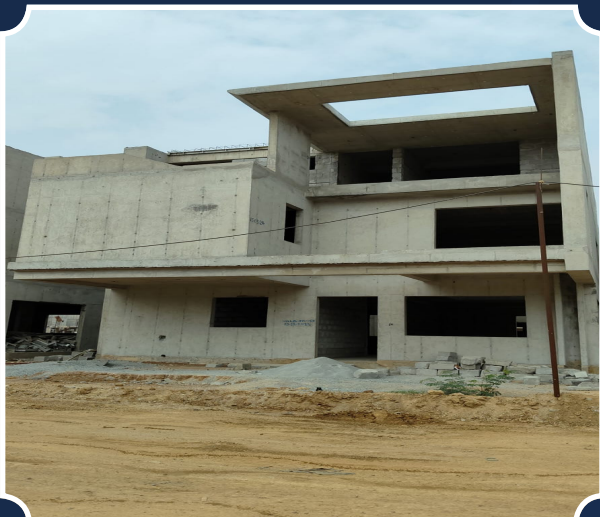
VILLA-69 (Structure completed)