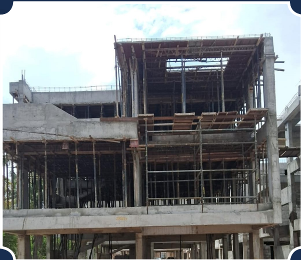
VILLA-25 (Structure Completed)