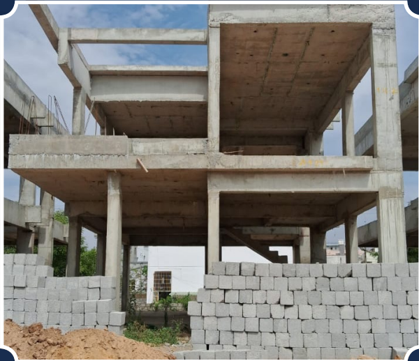
VILLA-3 (Structure Completed)