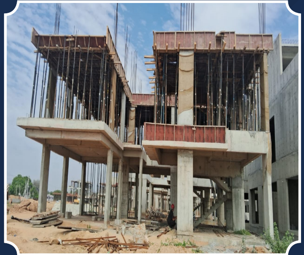
VILLA-139 (GF Slab Completed)