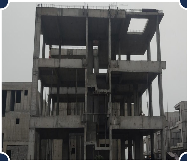
VILLA-132 (Structure completed)