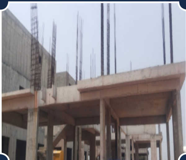
VILLA-161 (GF Slab Completed)