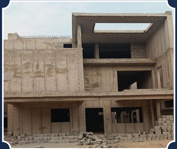
VILLA-127 (Structure completed)