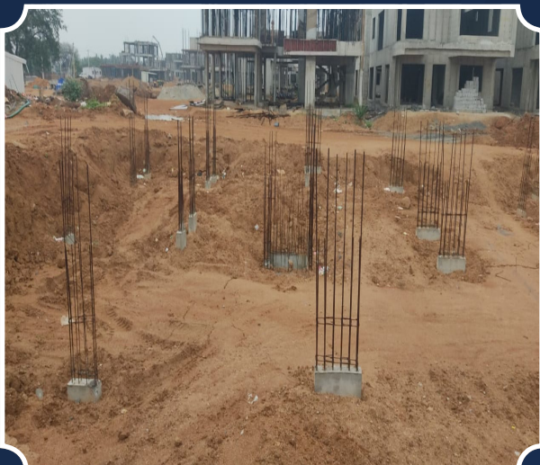
VILLA-167 (Pedestals Completed)