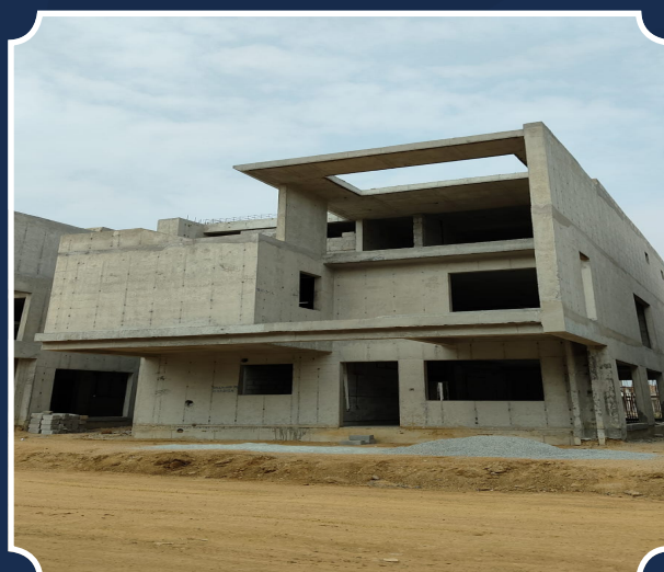
VILLA-74 (Structure completed)