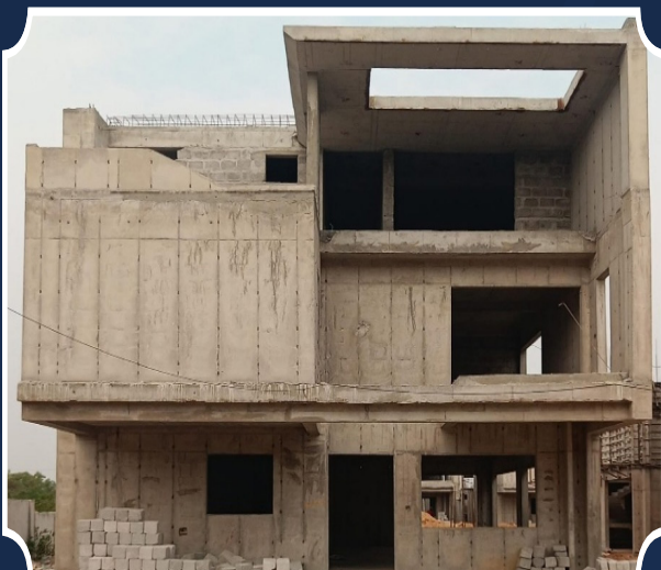
VILLA-124 (Structure completed)