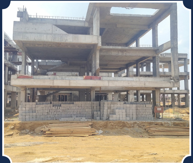
VILLA-26 (Structure Completed)