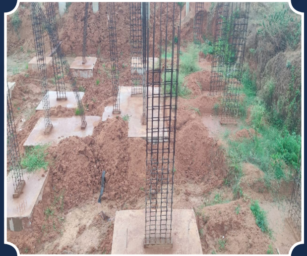
VILLA-170 (Footing pcc Completed)