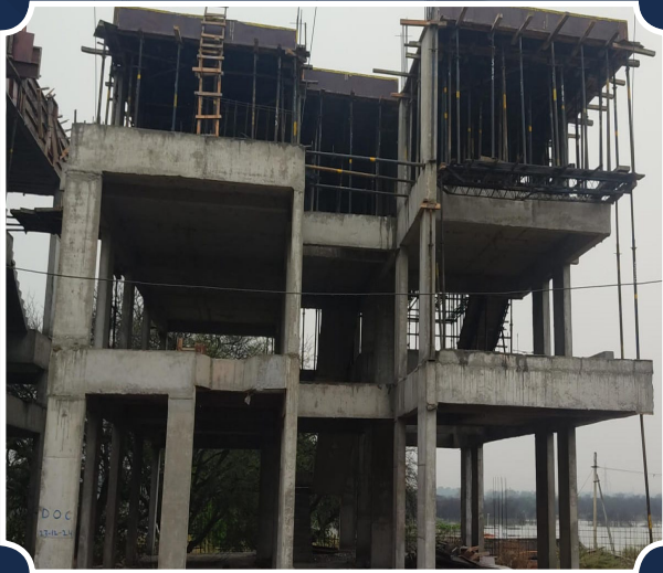
VILLA-187 (SF Columns Completed)