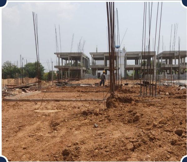
VILLA-19 (Back Filling Completed)