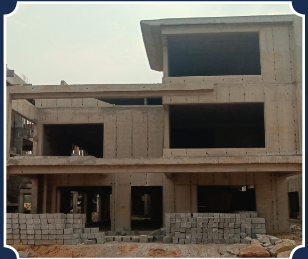
VILLA-117 (Structure completed)