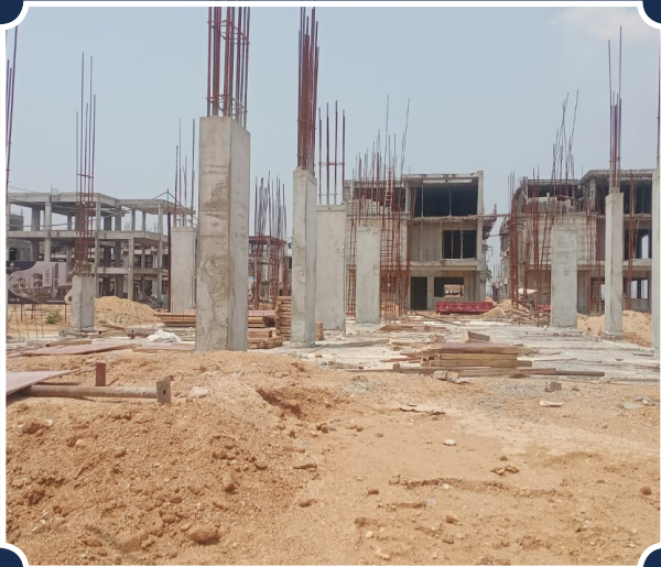
VILLA-12 (GROUND FLOOR COLUMNS COMPLETED)