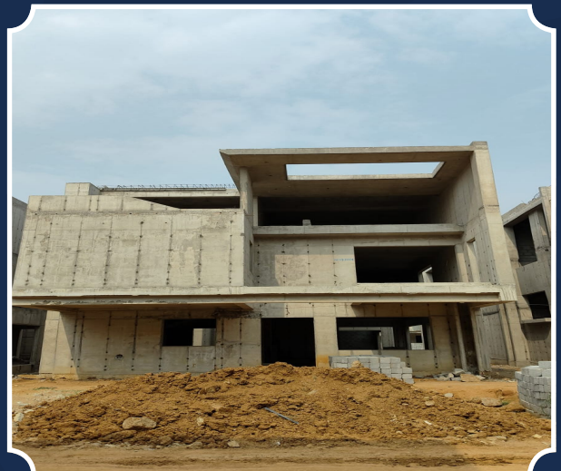
VILLA-105 (Structure Completed)