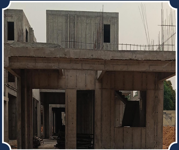
VILLA-178 (Gf slab Completed)