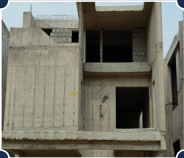
VILLA-134 (Structure completed)