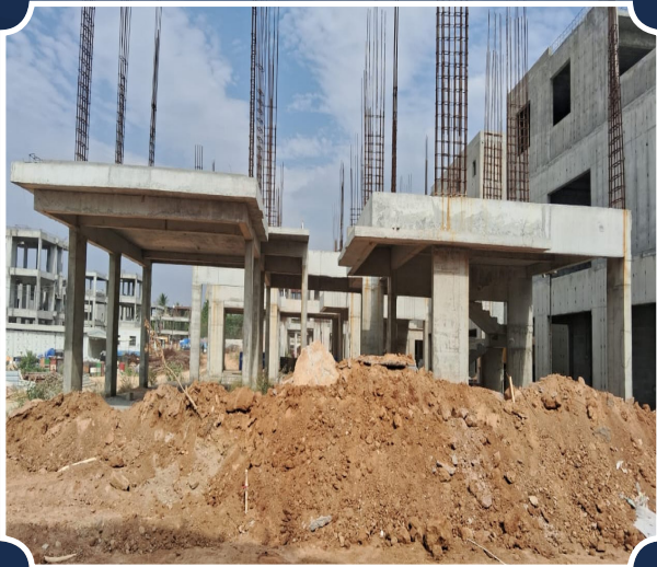
VILLA-171 (GF Slab Completed)