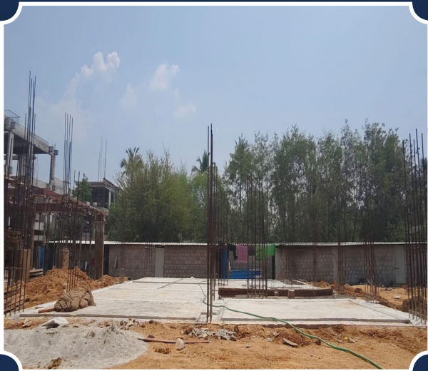
VILLA-189 (Grade Slab Completed)