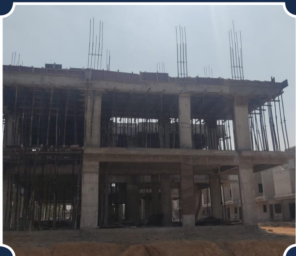
VILLA-45 (Structure completed)