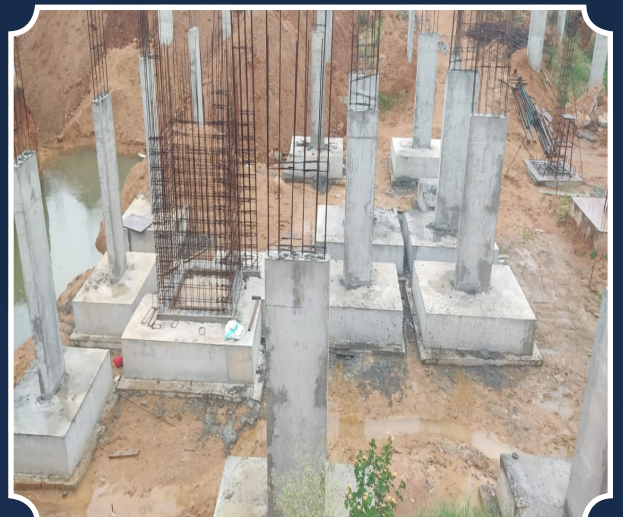
VILLA-168 (Footing Reinforcement Completed)