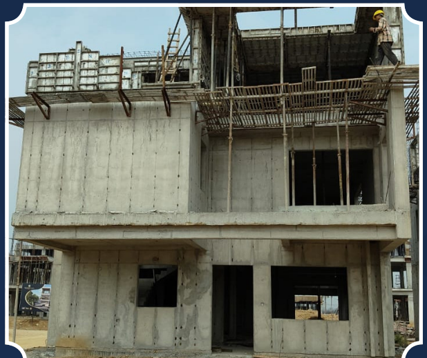
VILLA-28 (Structure Completed)