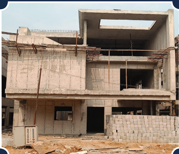
VILLA-100 (Structure completed)