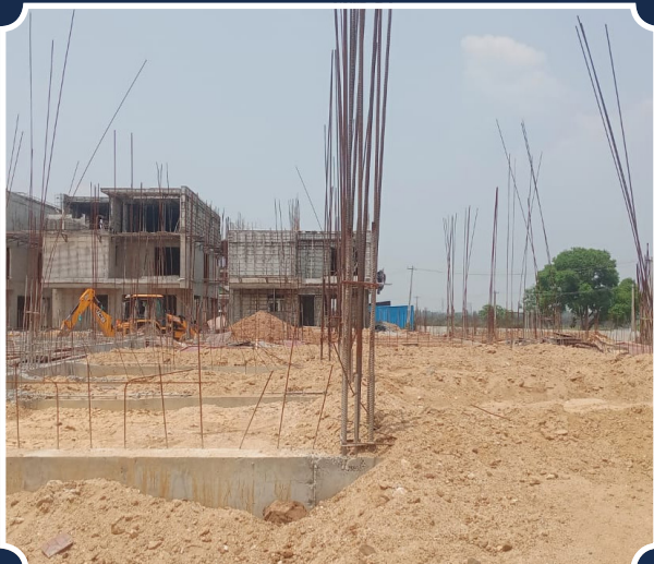
VILLA-14 (Plinth Beam Completed)