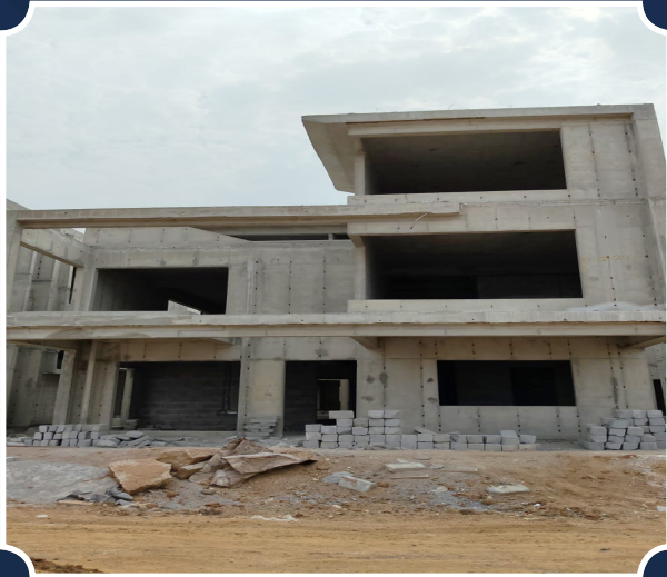
VILLA-144 (Structure completed)