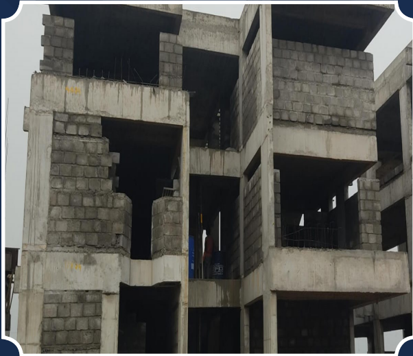
VILLA-181 (Structure Completed)