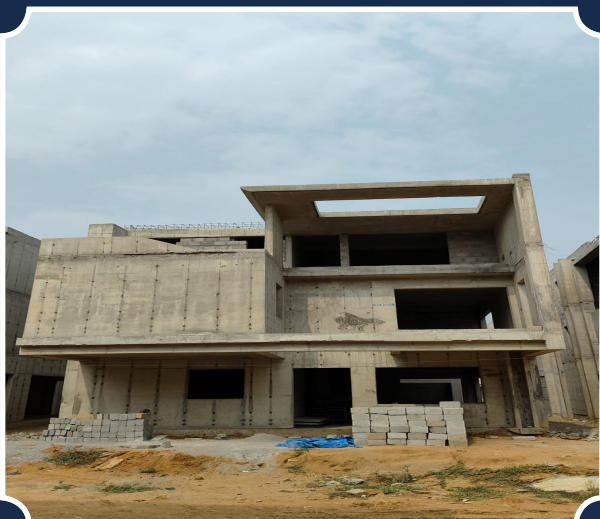
VILLA-106 (Structure completed)