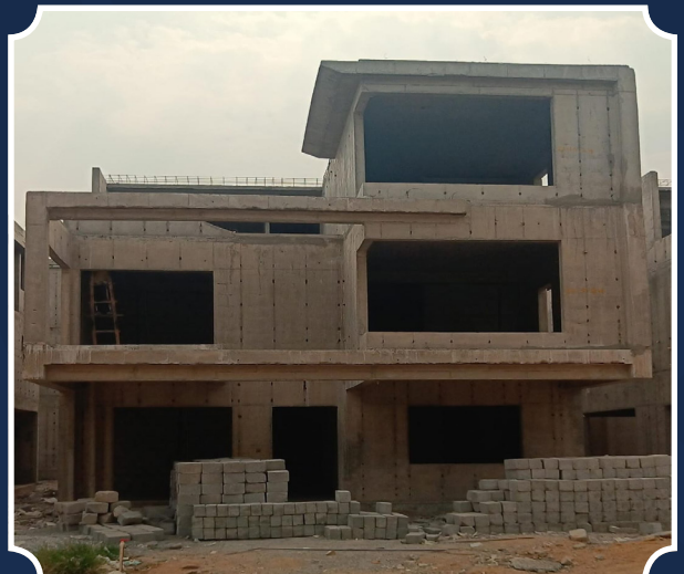
VILLA-119 (Structure completed)