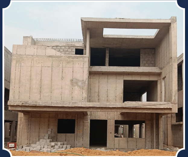
VILLA-158 (Structure completed)