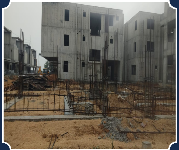
VILLA-115 (Plinth pcc Completed)