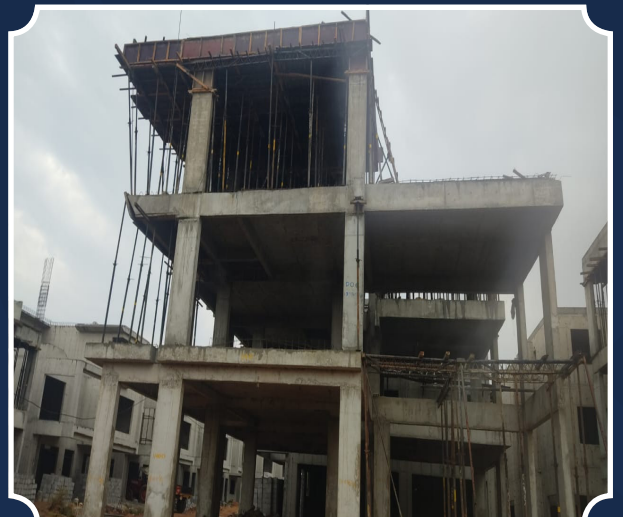
VILLA-101 (Structure completed)