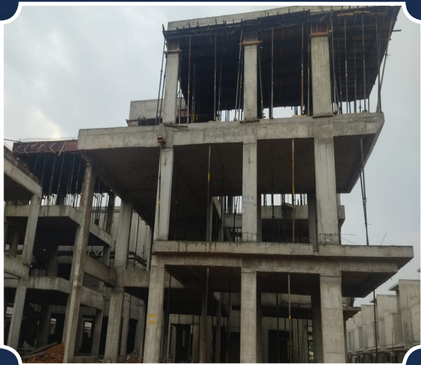
VILLA-116 (Structure completed)