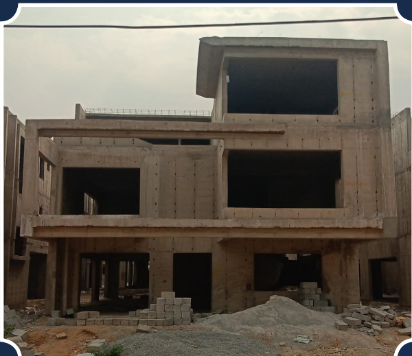
VILLA-118 (Structure completed)