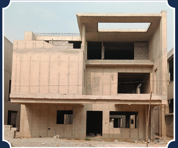
VILLA-97 (Structure Completed)