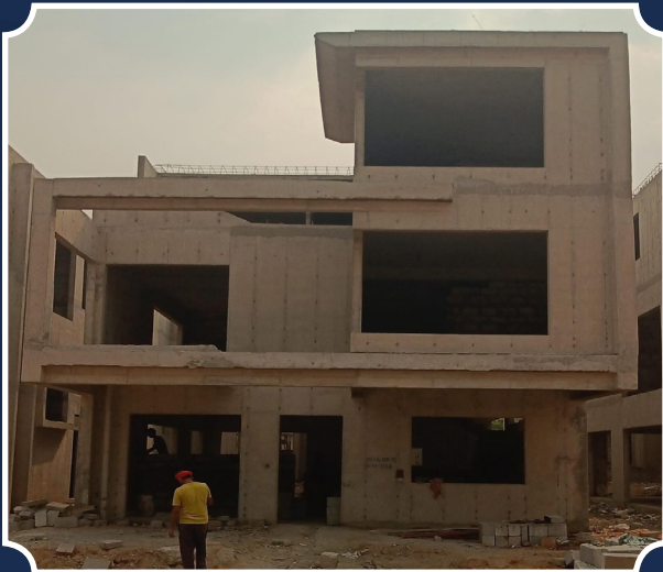
VILLA-91 (Structure completed)