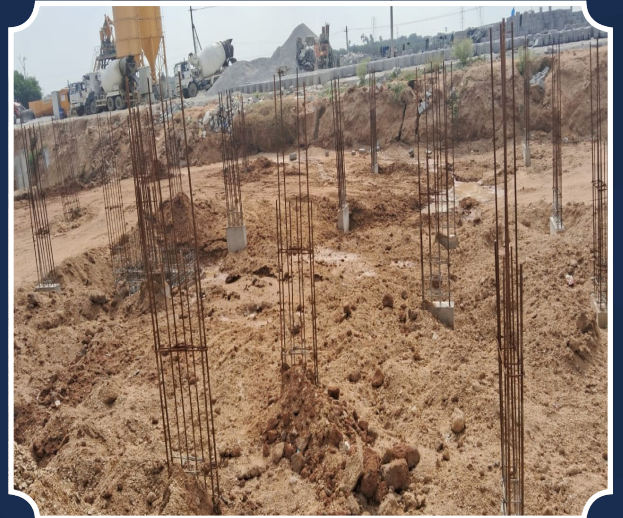
VILLA-166 (Pedestals Completed)