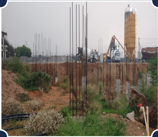
VILLA-163 (Pedestals Completed)