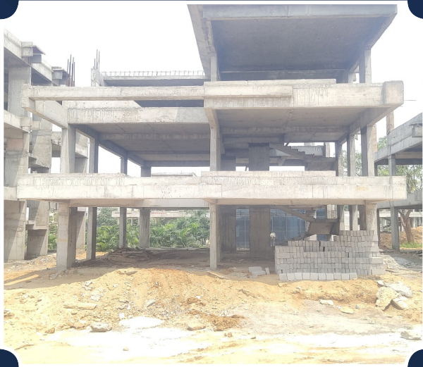
VILLA-23 (Structure Completed)