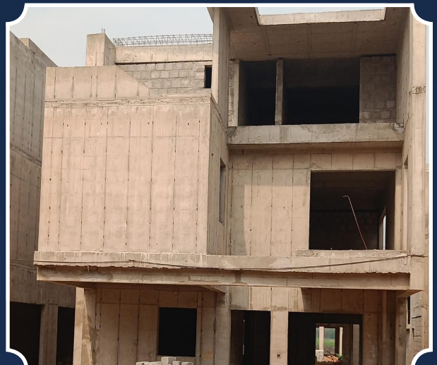
VILLA-156 (Structure completed)