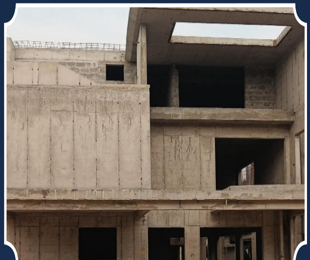
VILLA-125 (Structure completed)