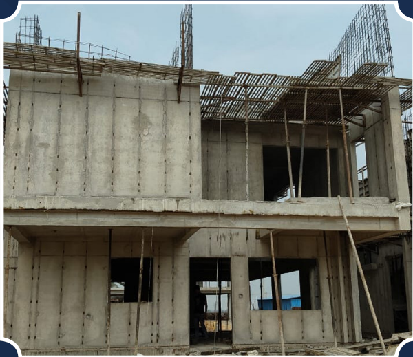
VILLA-29 (FF Slab Completed)