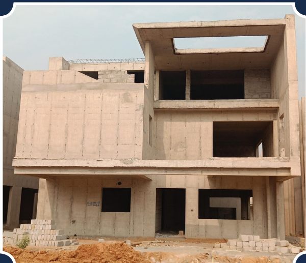
VILLA-63 (Structure completed)