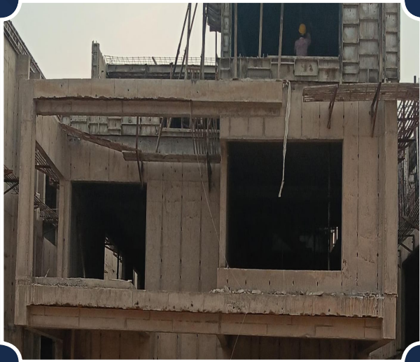
VILLA-150 (Structure completed)