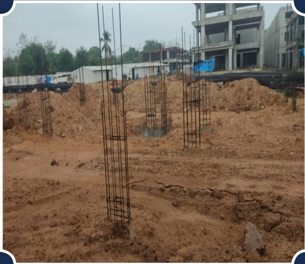
VILLA-67 (Pedestals Completed)