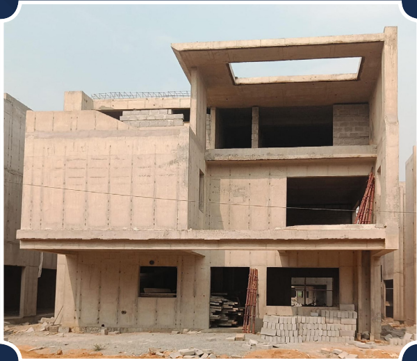
VILLA-96 (Structure completed)