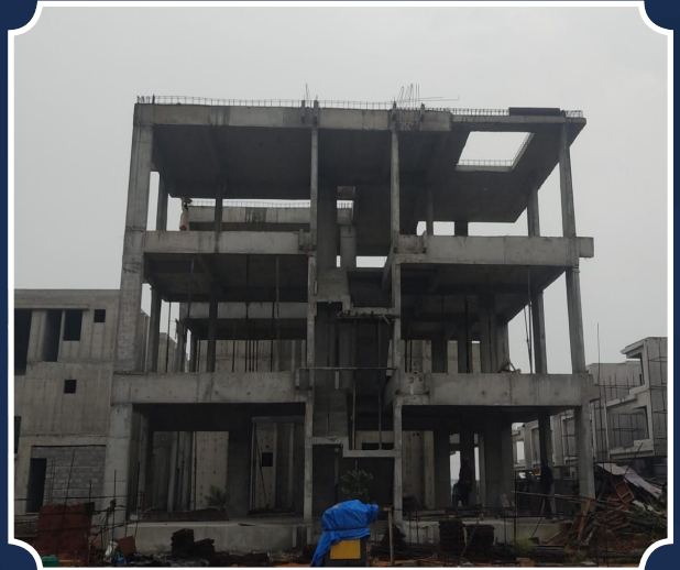
VILLA-135 (Structure completed)