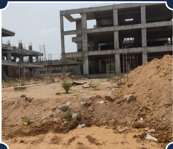
VILLA-27 (Plinth pcc Completed)