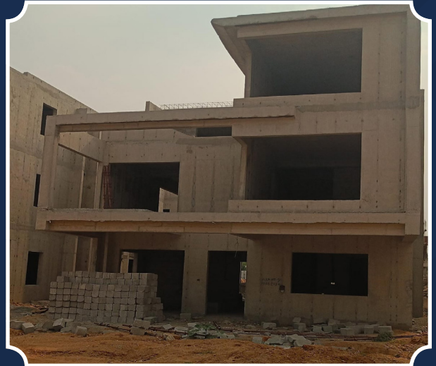
VILLA-90 (Structure completed)