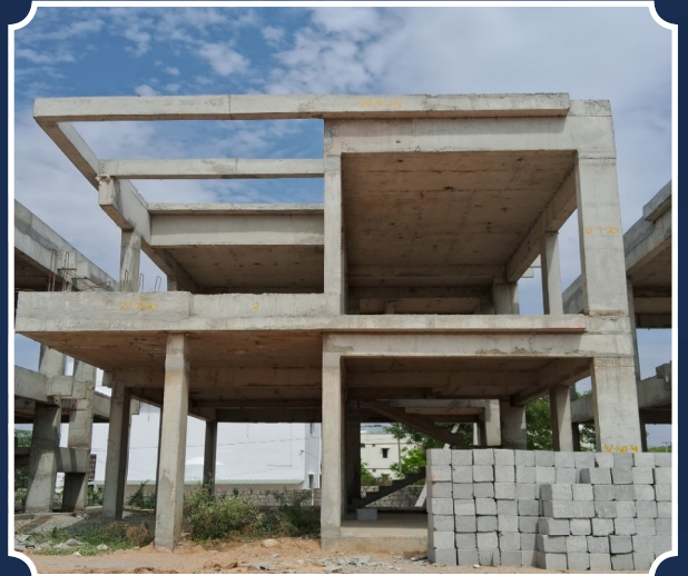
VILLA-4 (Structure Completed)