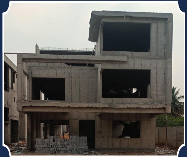
VILLA-123 (Plinth pcc Completed)