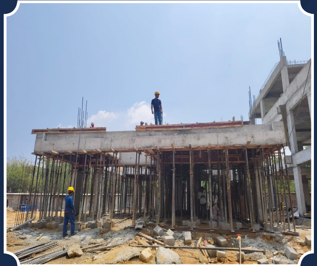
VILLA-48 (GF Slab in progress)