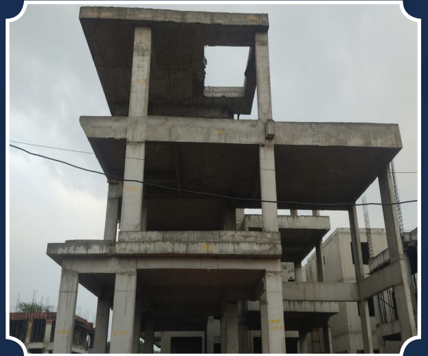
VILLA-66 (Structure Completed)