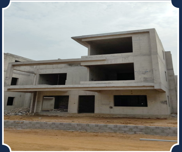
VILLA-84 (Structure completed)