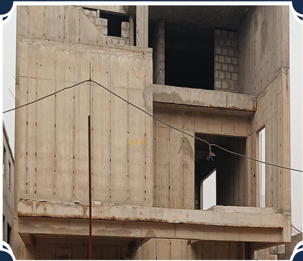
VILLA-130 (Structure completed)