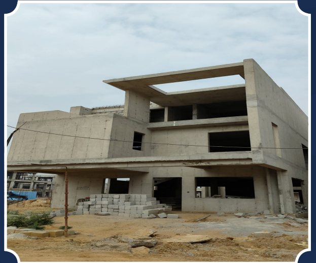
VILLA-68 (Structure completed)