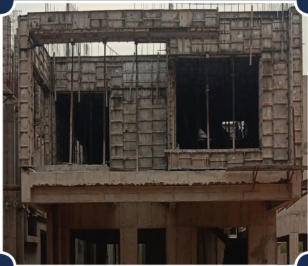
VILLA-152 (GF slab Completed)