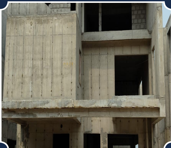
VILLA-136 (Structure completed)