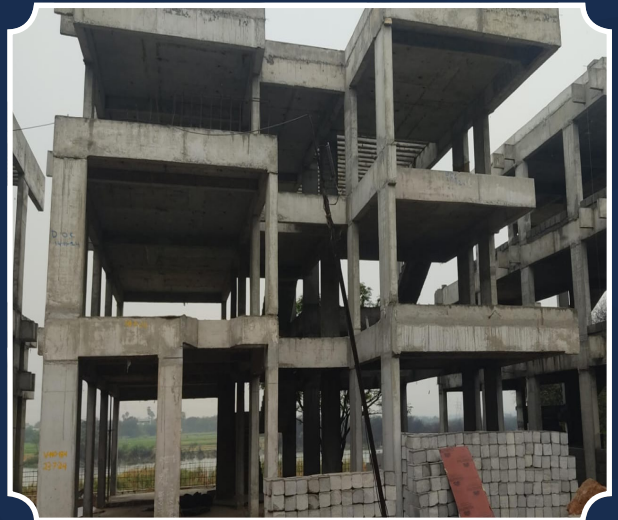
VILLA-184 (Structure Completed)