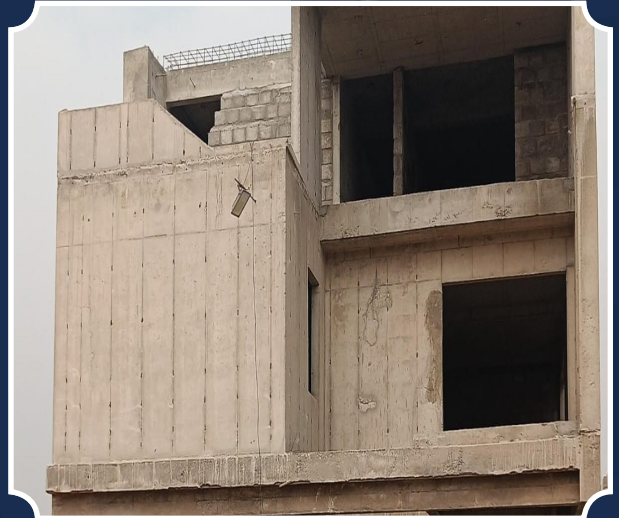
VILLA-154 (Structure Completed)