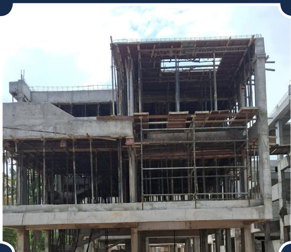
VILLA-33 (Pedestals Completed)