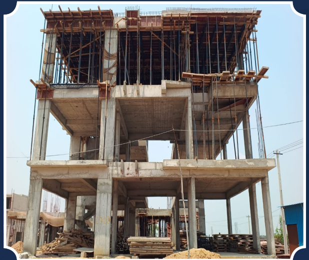
VILLA-50 (SF Columns Completed)