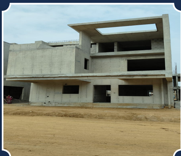
VILLA-73 (Structure completed)