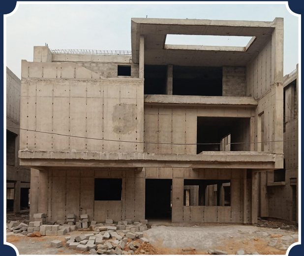
VILLA-129 (Structure Completed)