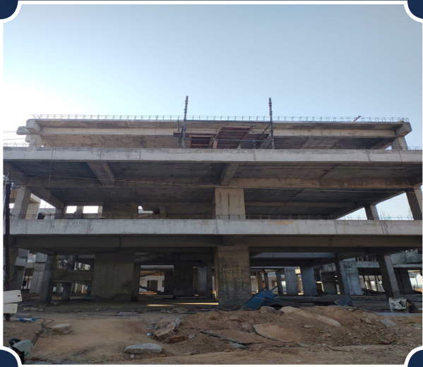
VILLA-47 (Structure completed)