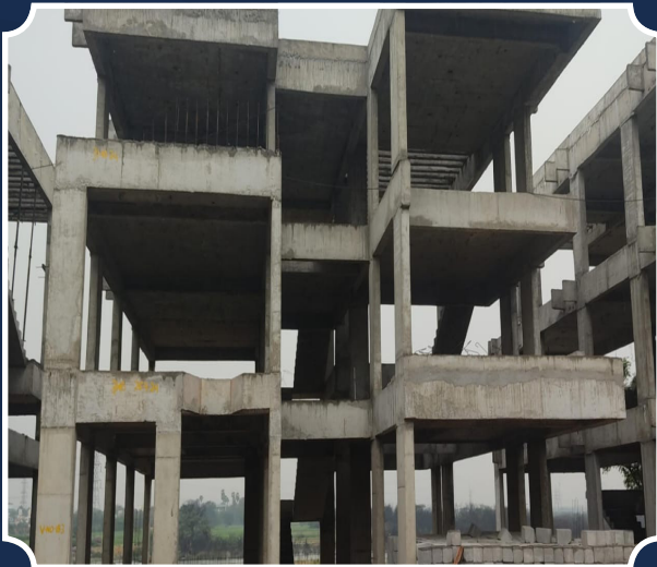
VILLA-183 (Structure Completed)