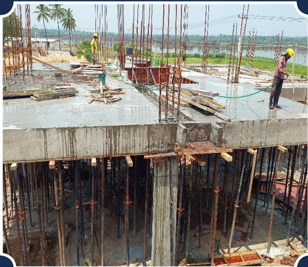
VILLA-43 (Gf Slab Completed)