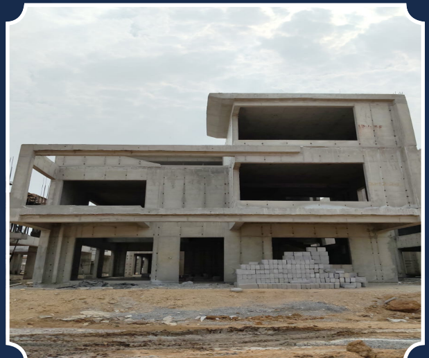
VILLA-143 (Structure completed)