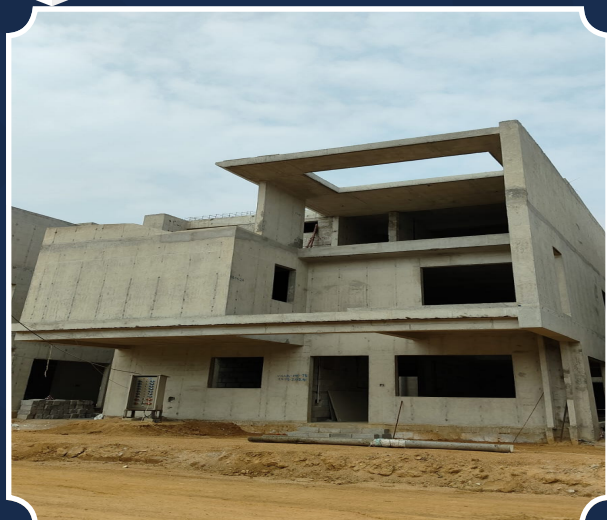
VILLA-71 (Structure completed)