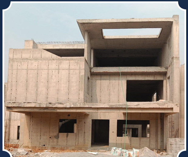
VILLA-95 (Structure completed)