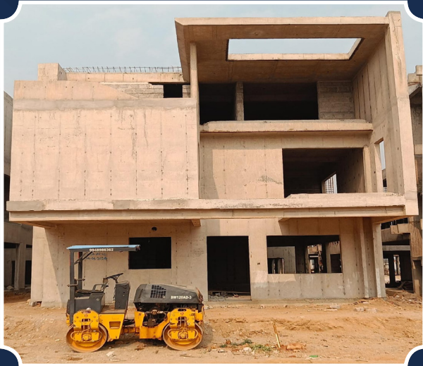
VILLA-65 (Structure completed)