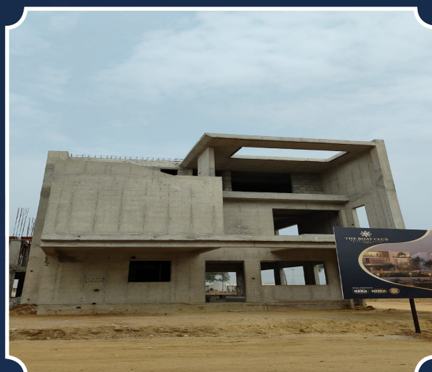
VILLA-76 (Structure completed)