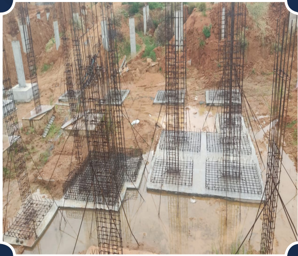
VILLA-169 (Footing pcc Completed)