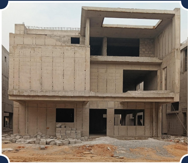
VILLA-128 (Structure completed)