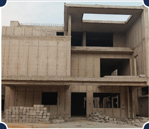
VILLA-126 (Structure completed)