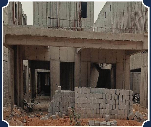
VILLA-176 (Gf slab Completed)