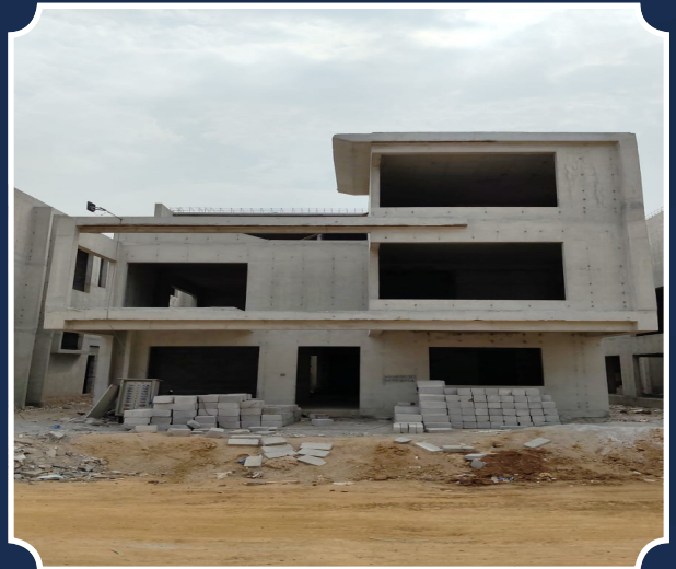
VILLA-111 (Structure completed)