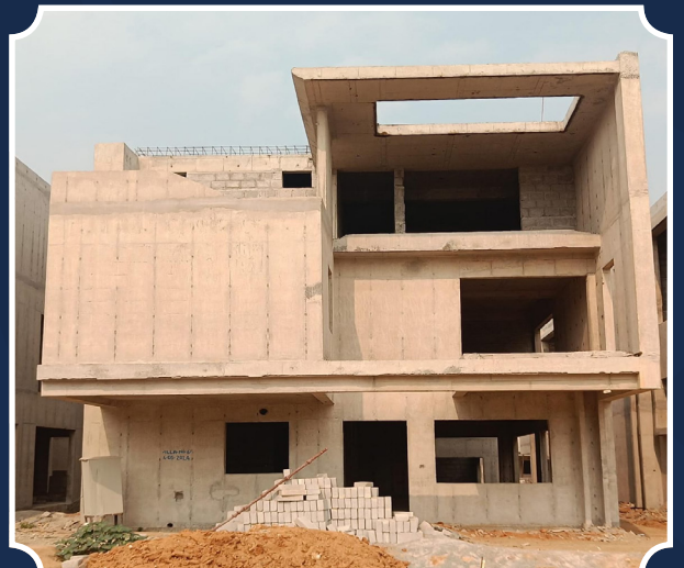
VILLA-64 (Structure completed)