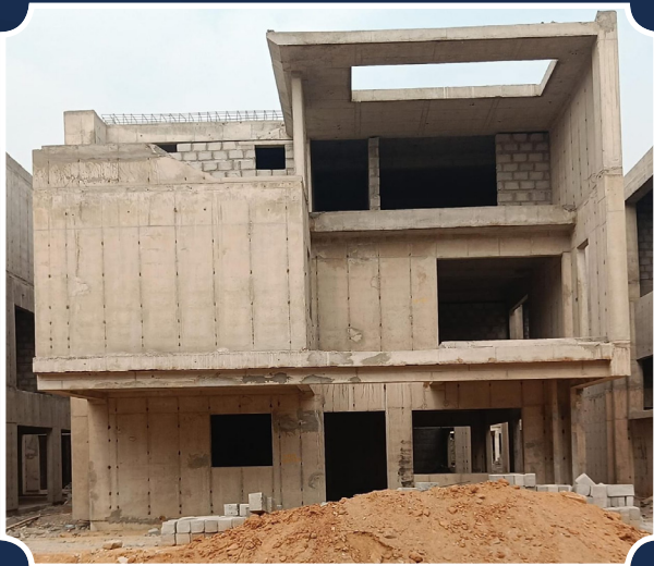
VILLA-159 (Structure completed)