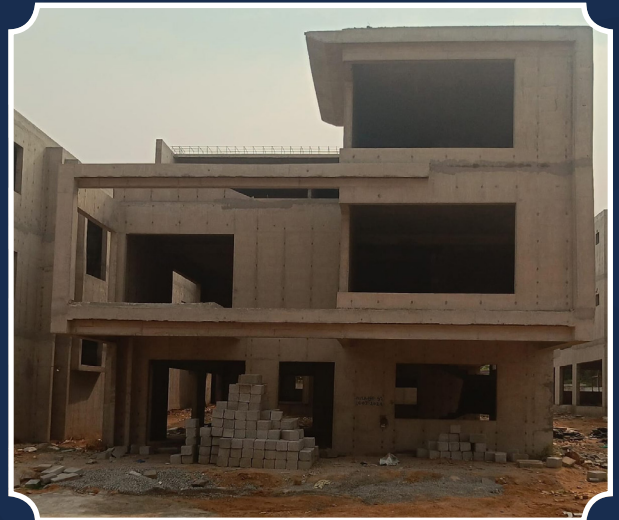
VILLA-92 (Structure completed)