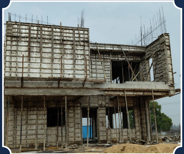
VILLA-30 (FF Slab Completed)