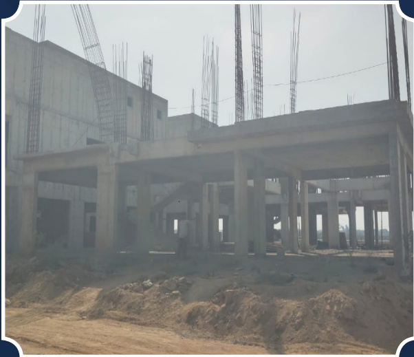
VILLA-138 (GF Slab Completed)