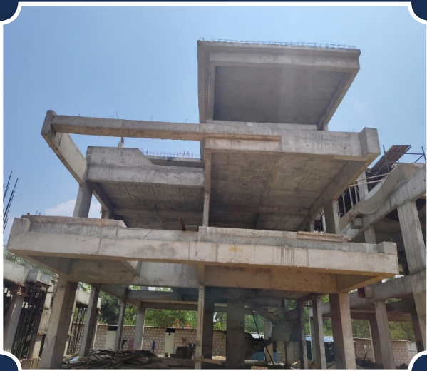
VILLA-49 (Structure completed)