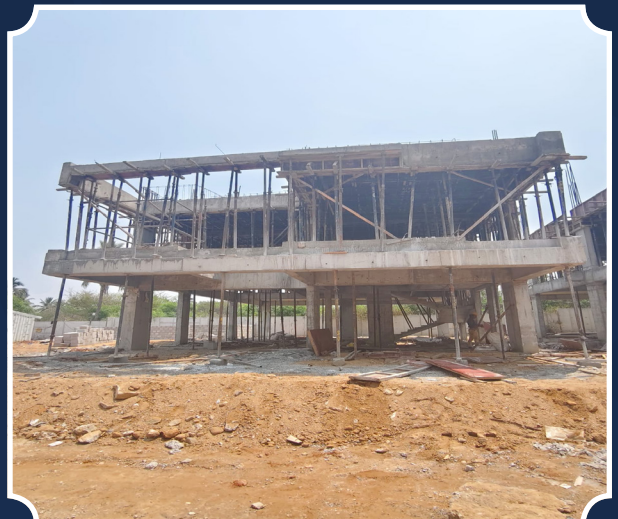
VILLA-57 (FF Slab Completed)