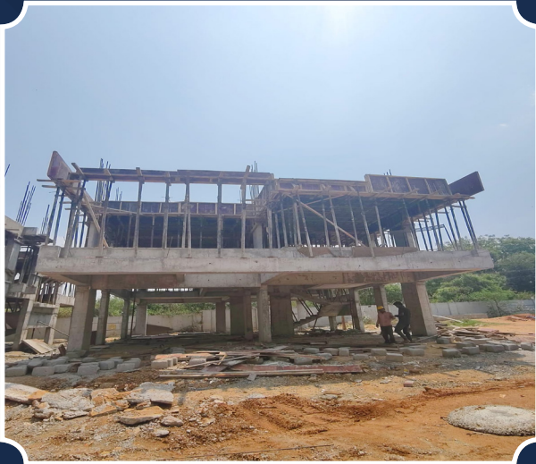
VILLA-58 (FF Columns Completed)