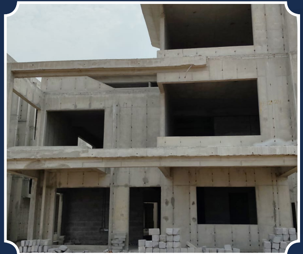
VILLA-141 (Structure completed)