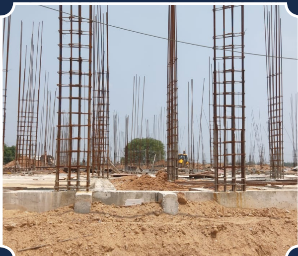
VILLA-21 (Grade Slab Completed)