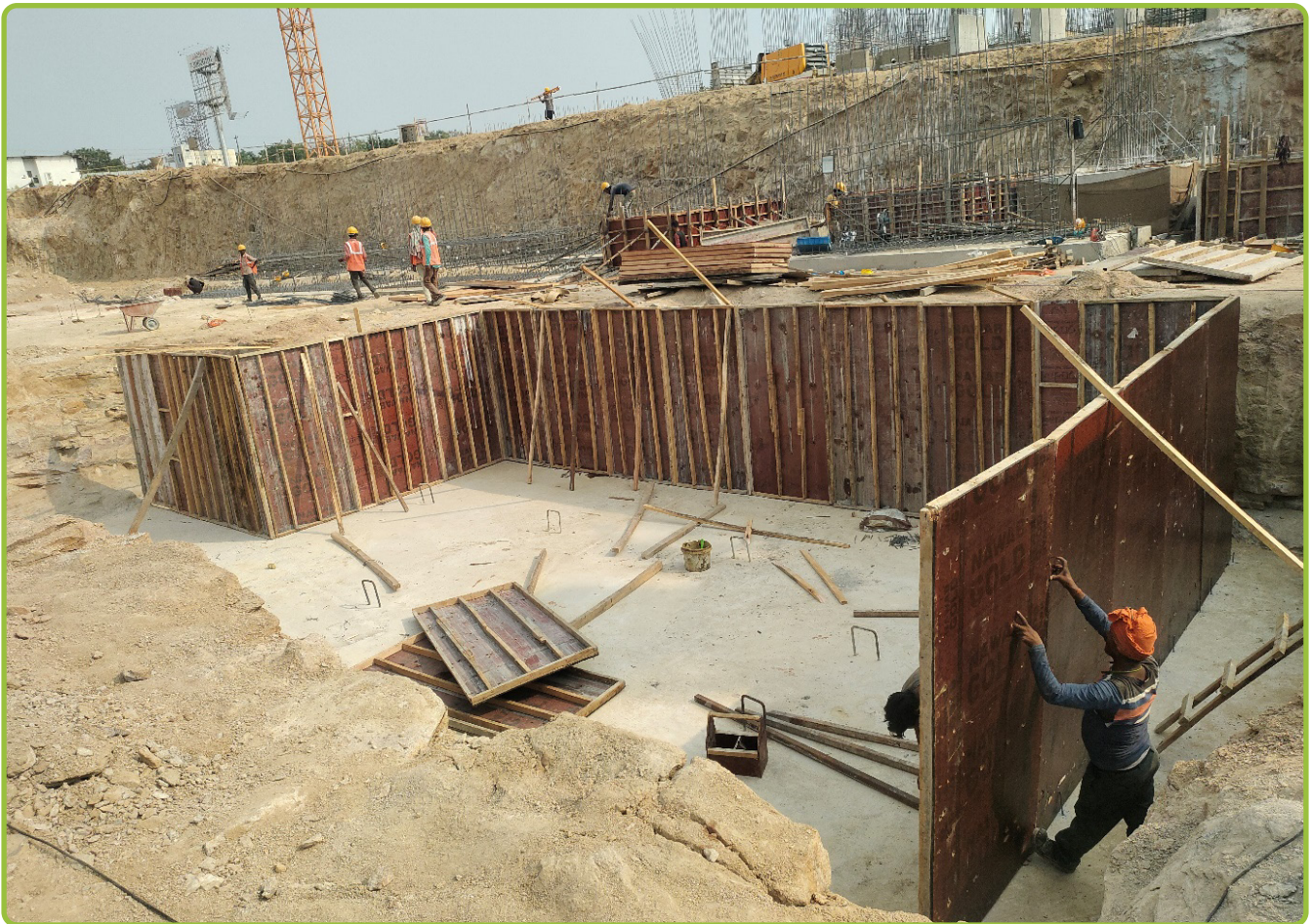
Tower-D Lift Pit PCC work is in progress