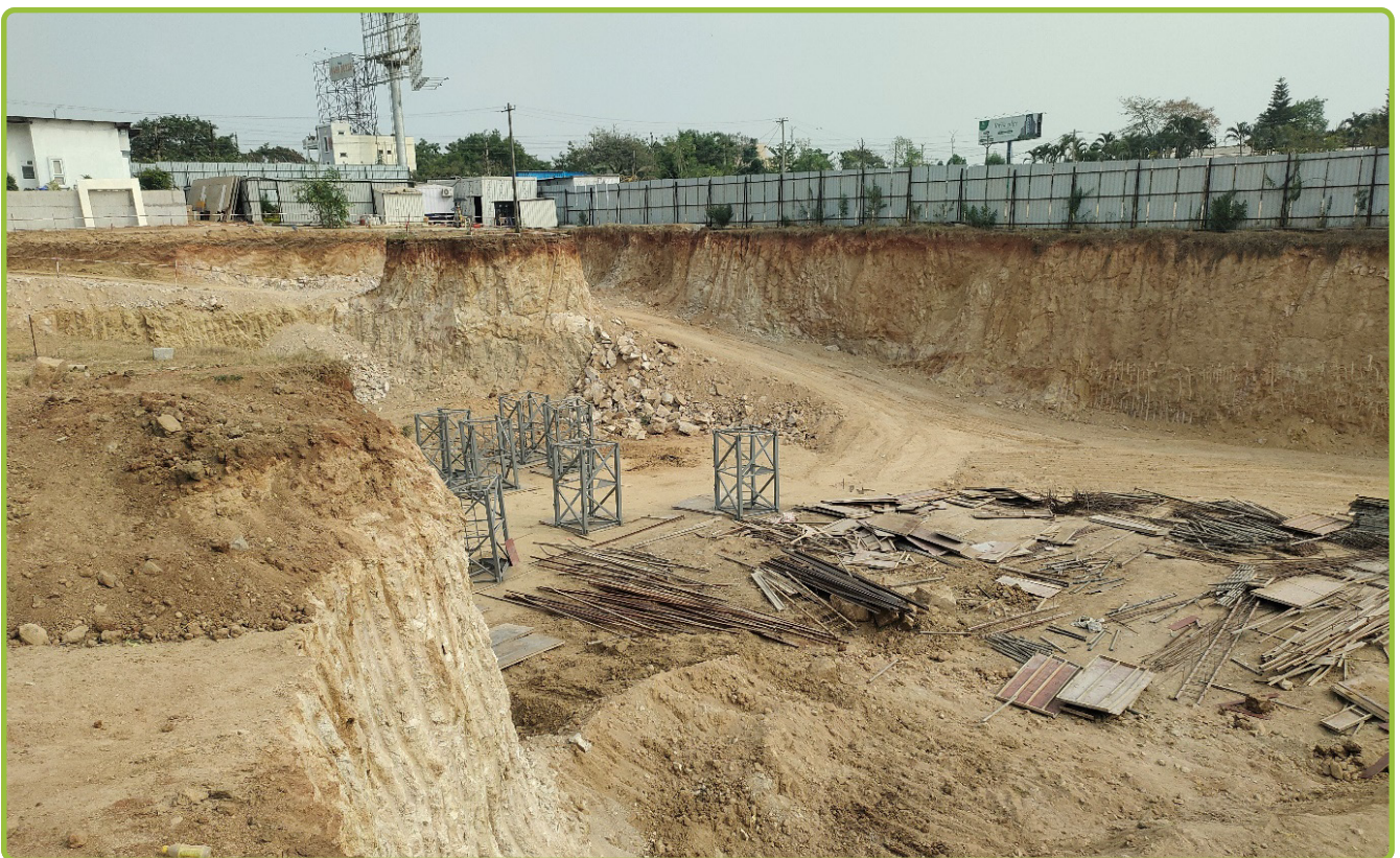
Tower-A Excavation work is in progress