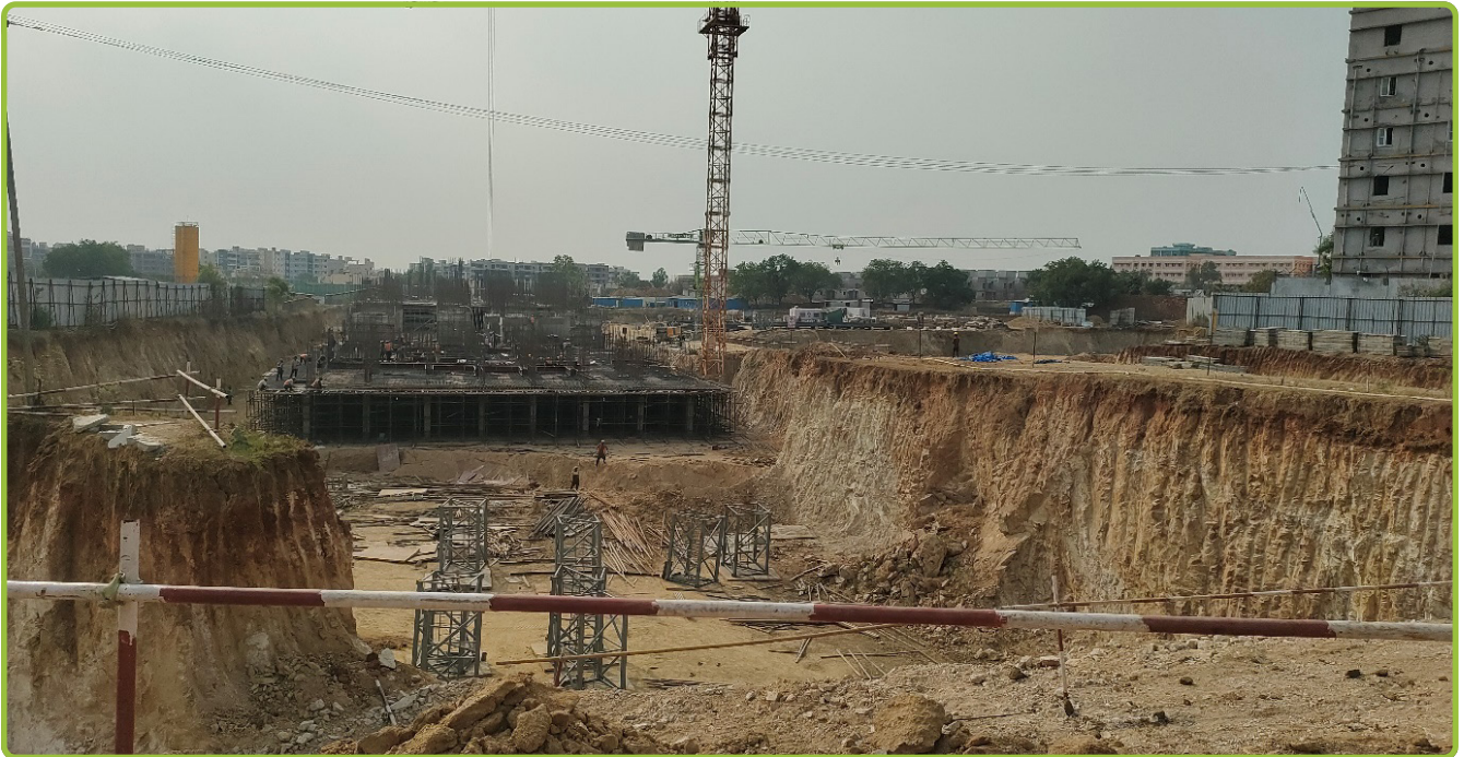
Total Site View