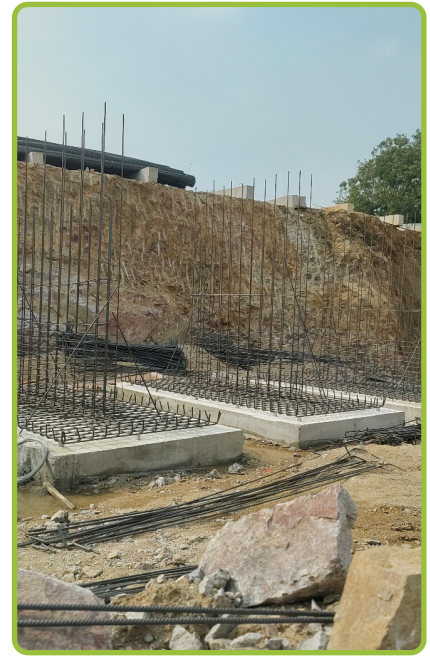
Tower-D Footings Reinforcement work is in progress