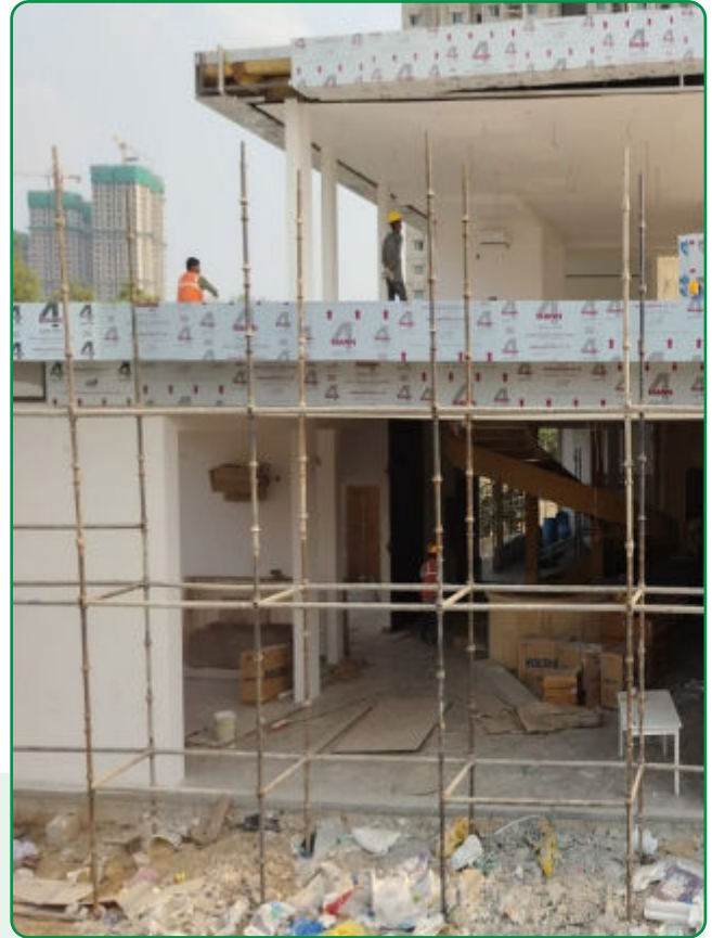
Sale office & Model Flat North side view