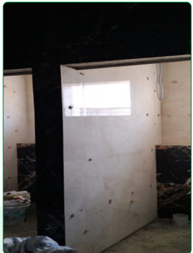
Ground Floor Entrance Arch work in progress